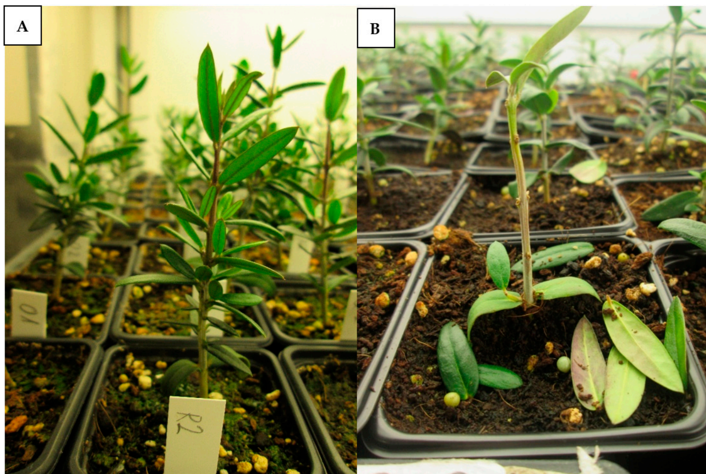
Figure 1. Olive genotypes growing in the climatic chamber: (A) Control plant without symptoms; and (B) typical observed symptoms (green defoliation) in an inoculated genotype during the evaluation.

Approximately three months after germination, the seedlings were successfully infested by the pathogen by root dipping in a conidial suspension (Figure 1).