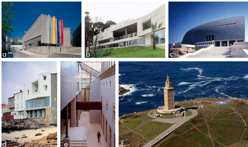
Fig. 2. Architecture in A Coruña and its surroundings. (a) Centro Gallego de Arte Contemporáneo by Álvaro Siza. (b) Facultad de Fisioterapia by Manuel de las Casas. (c) Domus by Arata Isozaki. (d) Casa de Corrubedo by David Chipperfield. (e) Museo de Bellas Artes da Coruña by Manuel Gallego. (f) Tower of Hércules.