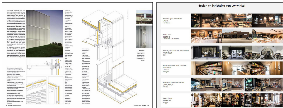
Fig. 1. Left pic: magazine example that combines different graphical representation and text. Right pic: website example based on shocking photographs.

Digital architectural information is usually much more limited. The websites dedicated to architecture significantly simplify the information. The authors of blogs or specialised websites are highly selective about the information they provide. In general, these sources provide fewer descriptive plans, insufficient to define the building, but present a greater abundance of "shocking" photographs or renders (see Fig. 1). They rarely provide constructive details and, as a result of taking into account visual fatigue, the continuous changing of pages and a certain dispersion of attention, they provide many fewer texts, avoiding any in-depth explanation of the architectural work.