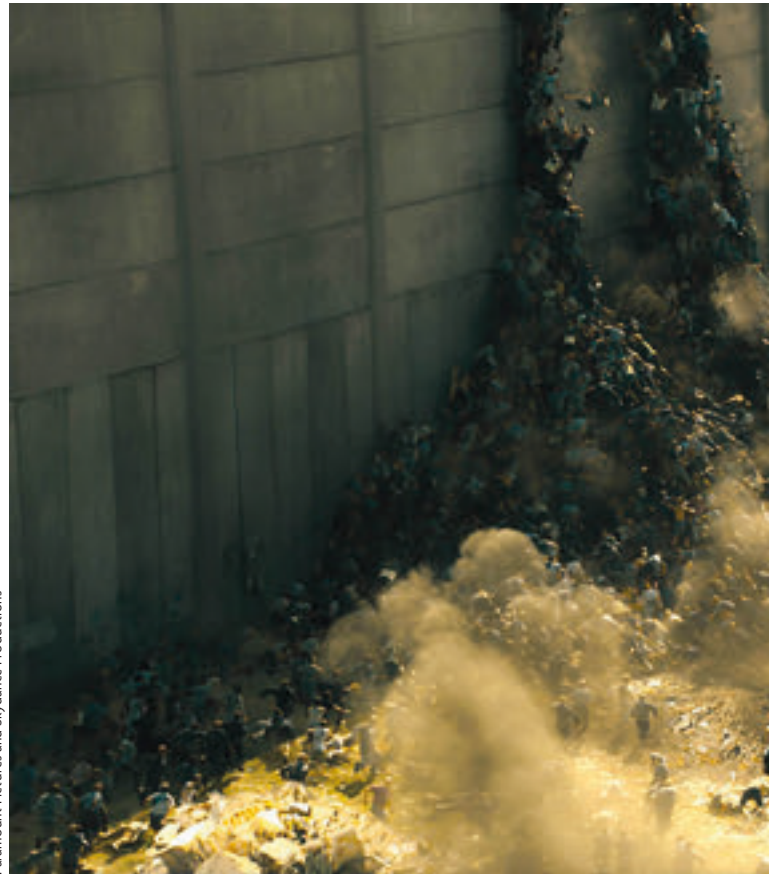
Paramount Pictures and Skydance Productions

In light of this difference between the zombie narratives of the past and present, there is an argument to be made that the contemporary zombie film reflects a straightforward fear of a viral pandemic in our current era, revealing our anxiety about both the power and the ineffectiveness of modern biomedical sciences. In this article, I offer a close reading of three recent movies that tell the story of fast-moving, virus-infected zombies and the collapse of civilization. These movies are not intended to represent all contemporary zombie narratives; they are just three revealing examples. My interest in examining these movies is not just to highlight the fear of contagious disease that they reflect and promote among an increasingly mobile and interconnected global population in an age of bioscience, but to tease out the specific way in which each movie portrays the figure of the scientist. As German sociologist Peter Weingart (2003) suggests, the ethos of the scientist developed through «images, clichés, and metaphors» in fictional film can tell us much about the relationship between science and society. So what does the portrayal of the scientist in contemporary zombie movies tell us about the way we think about scientists in our modern world?