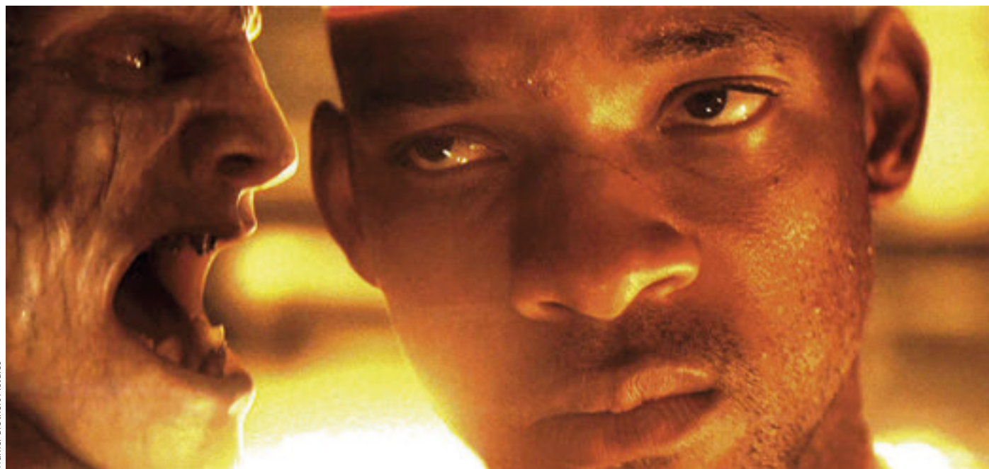
Warner Brothers Pictures

An alternate ending was shot for I am legend , but it did not test well with audiences, so it was changed. In that version, the main character respected the Dark Seekers' lives.