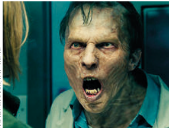
Paramount Pictures and Skydance Productions

A number of explanations have been offered for this outbreak of apocalyptic narratives featuring hordes of the undead and the breakdown of civilization. The rise of the genre is said to reflect xenophobic anxiety about immigration and the fecund reproduction of the dark «Other» in a so-called «post-racial» era. On the left and above, stills from the film World War Z (2013).