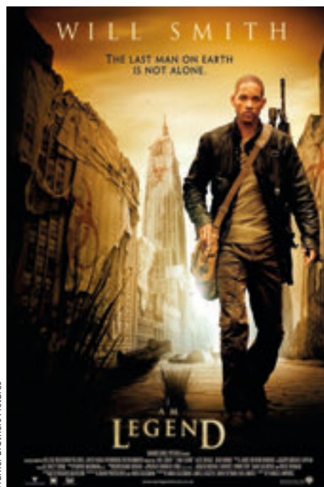
Warner Brothers Pictures

However, what is most interesting about this film is not the potential versatility of the figure of the scientist, but that a more complicated representation was cut from the official version. I am legend did not always have the ending described above. In fact, it started with a very different narrative arc