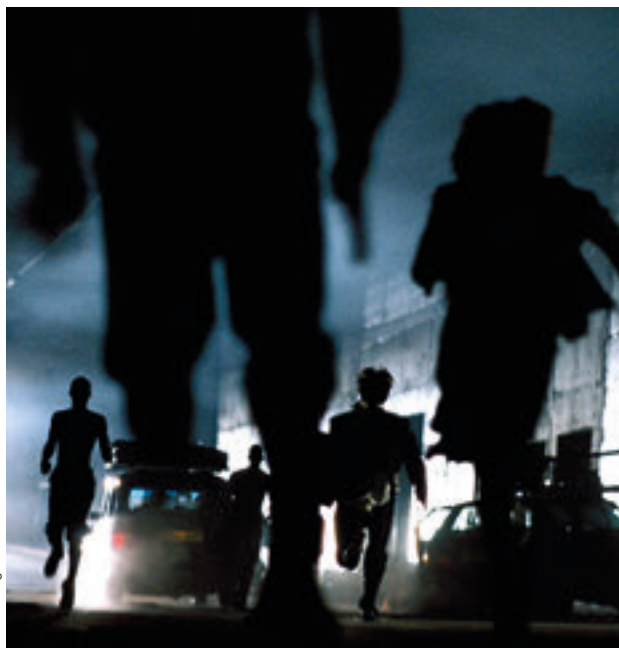
Fox Searchlight Pictures

activists as they prepare to free the animals and stutters out a warning: «the chimps are infected. They're highly contagious». He then offers an unsolicited justification for his treatment of these animals: «In order to cure, you must first understand».