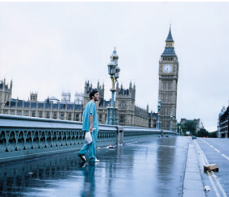
Fox Searchlight Pictures

Our contemporary fear of viral apocalypse is thus tied to our ambivalence about scientists, who can be figures of scorn or worship, both the cause of the coming catastrophe and the source of our salvation. Above, stills from 28 days later (2002), in which the protagonist wakes up from a coma to a city devastated by a virus after a group of infected chimpanzees were liberated.