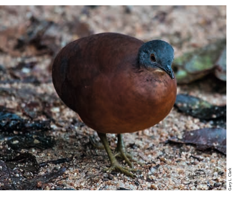
The little tinamou ( Crypturellus soui ), which belongs to one of the most ancient bird lineages on Earth, hosts more than twenty species of lice, with up to nine species recorded from a single individual.

enemies all the prominence in population and community regulation (Terborgh, 2015).