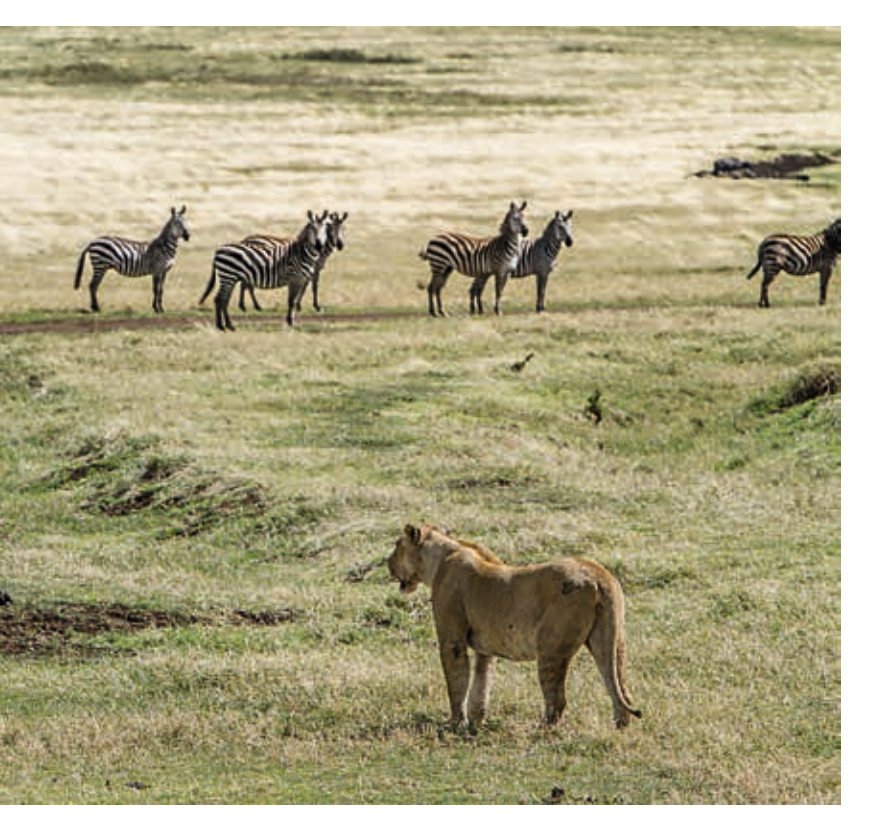
Many organisms all over the world provide food for others. In this sense, natural enemies represent a substantial part of biodiversity. In the picture, a lioness observes a group of zebras.