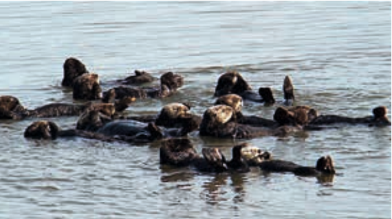
The photo on the left shows a kelp forest at Point Lobos State Nature Reserve in Carmel-by-the-Sea (Monterey, California). The sea otter ( Enhydra lutris ), which feeds on sea urchins, lives on the shores of Point Lobos. The sea urchin is a voracious algae eater that, if unchecked by otters, ends up eliminating kelp forests and destroying the ecosystem they support. The photo on the right shows a group of sea otters resting.

A comprehensive body of theory about indirect interaction mediated by shared enemies has been developed over the last several decades, extending its roots deeply into other fields of ecology, such as metacommunity ecology, foraging theory, invasion biology, disease dynamics, harvesting, and pest control. Apparent competition is a fundamental concept in ecology that has helped to inform a more consistent theory of coexistence mechanisms, and incorporating food web interactions more generally has substantially extended our knowledge about diversity dynamics and regulation.