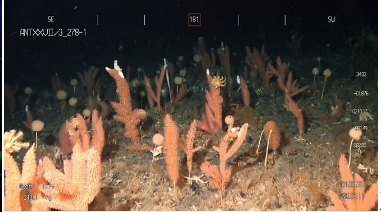
Figure 4. Very dense population of gorgonians, sponges, and bryozoa, with individuals or colonies of different sizes. In Antarctica, populations of sessile species, in addition to specimens of different ages which are fruit of a long process of colonisation and growth, are present at high densities.