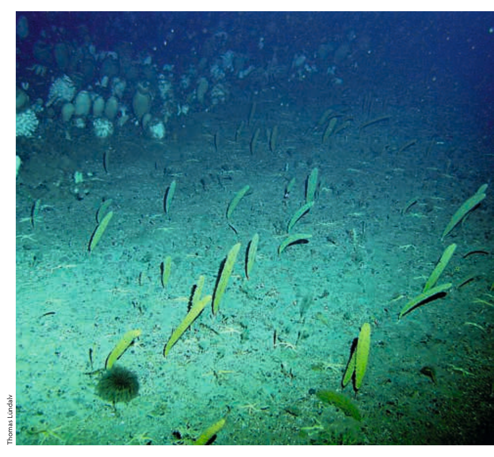
Figure 3. A mosaic of impacted areas (foreground) with a pioneering population of gorgonians ( Ainigmaptillon sp.), and non-impacted areas (background) with a community characterised by much greater structural complexity.

when the environmental conditions of this location are so extreme. Again, the low temperatures are one of the key factors. For millions of years, the Antarctic shelves have been covered by a layer of surface marine ice which stayed during the winter and melted in the summer; this ice is one of the most productive ecosystems in the world (Thomas & Dieckmann, 2002). The salt trapped inside it during the freezing process facilitates the formation of a system of millions of tiny canals in which a