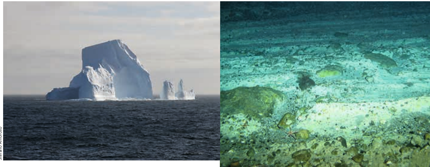
Figure 2. On the right, a drag mark left by an iceberg such as that shown in the image on the left. This is the most important natural disturbance that affects the seabed of Antarctic platforms. Any environmental phenomenon, such as global warming, that increases the presence of icebergs, will have important consequences for Antarctic seabed life.

and the epibiont fauna was very rich, as were fish and crustaceans. Even though we knew from previous studies (Gutt & Starmans, 1998) that the benthic biodiversity –described as the richness of species living on the seabed – in the Antarctic continental shelves was one of the highest in all the oceans around