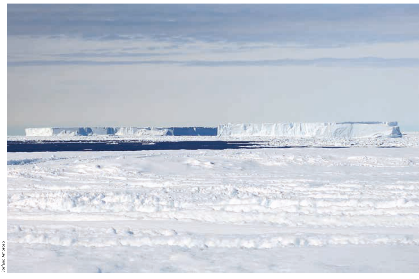
Figure 1. Studying the continental shelves of high Antarctica can provide a benchmark reference habitat that has experienced very little human influence and to learn more about the state of seabeds around the planet. The picture shows a panoramic view of the Weddell sea.

Icebergs detaching from the Antarctic continent glaciers are the main natural disturbance - almost the only one – that affects the Antarctic shelf seabed (Figure 2). The floating ice masses drag along the seabed for days or weeks, impacting long stretches and creating a complex habitat formed by a mosaic of disturbed and undisturbed areas. This partially or completely affected seabed is soon recolonised by nearby organisms, and this leads to the succession process. The early stages of this process are characterised by low abundance and diversity, and low substrate coating. The first colonisers usually grow quickly and have low structural complexity, while the final stages of the succession present high species richness and an exceptionally high biomass (Figure 3). These situations also occur in other types of ecological succession, for instance, the recovery of a forest area after a fire, on seabeds damaged after trawling, etc. Although it is estimated that only 5%of the high Antarctic seabed has been affected by the action of icebergs in the last millennium (Gutt, 2000), the impact is very significant because the destroyed