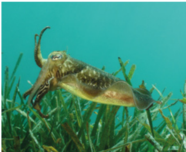
Lluís Maas Blanch