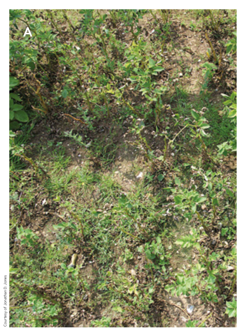
Figure 3. In the pictures, field trials at an advanced stage of late blight outbreak. They show the original potato cultivated variety Desiree ( A ) and the same variety containing the intracellular receptor Rpi-vnt1.1 ( B ), with no evident symptoms of potato late blight, caused by the pathogen Phytophthora infestans . Images were taken in 2012 field trials and were kindly provided by Prof. Jonathan D. Jones (The Sainsbury Laboratory, Norwich, UK).

The effectiveness of this type of resistance was first demonstrated by Sir Rowland Biffen in his wheat disease-resistance breeding program in the early twentieth century (Biffen, 1905). Since then, intracellular immune receptors have been widely