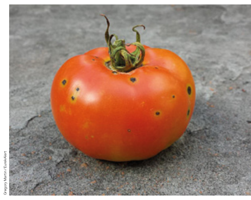
Figure 4. New genetic editing technologies can easily provide crop resistance to diseases such as the bacterium Pseudomonas syringae . In the picture, effects of this bacterium on a tomato fruit.

«Nowadays, there are only a few examples of genetically engineered disease-resistant crops that have made it to the commercial level»