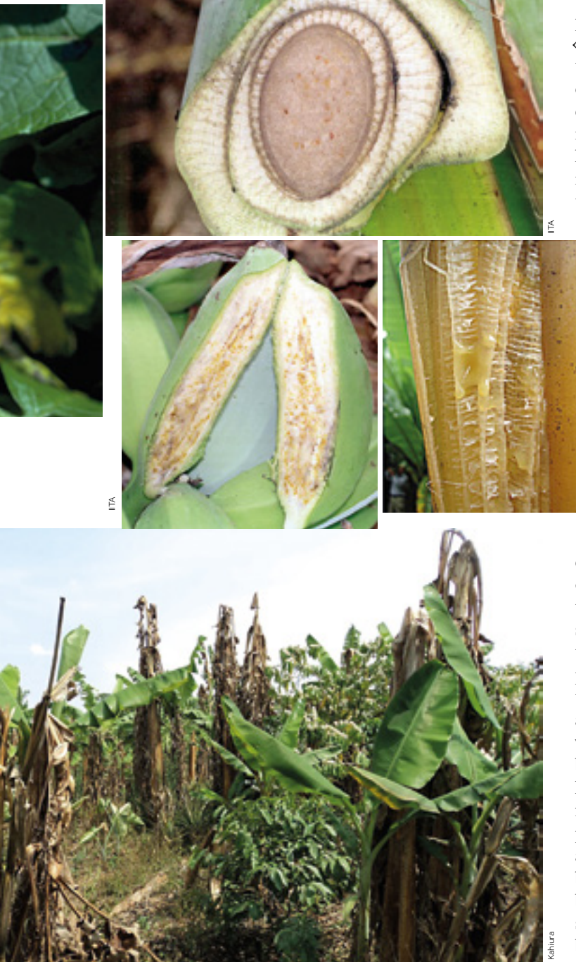
Figure 2. Genetic engineering strategies for transferring a series of cell surface sensors to crop species have been shown to be very effective. Among others, these strategies have provided increased resistance to diseases such as the bacterial wilt of the banana caused by Xanthomonas , which poses a threat to agricultural production in some regions. In the pictures at the top, details from fruits and leaves affected by Xanthomonas campestris , and below, banana plantation in Tanzania, showing the effects of the bacterium.

phytotoxins and deliver virulence molecules called «effectors» into plant cells to attack plant host targets and promote infection. Effectors contribute collectively to pathogenesis by attacking multiple cellular defensive processes and their action is essential for disease progression. The second line of plant defense is performed by intracellular immune receptors that detect effectors upon their injection into plant cells. After perception,