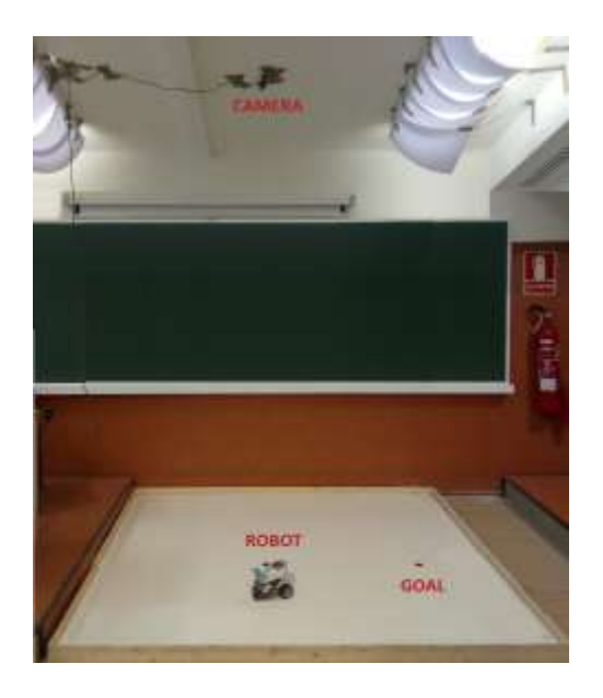
FIGURE 2 INITIAL EXPERIMENTAL SETUP

This setup, although very simple, has some economic and technological difficulties to be considered: