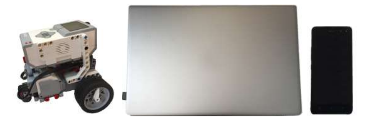
FIGURE 3 NEW SETUP: ROBOT, COMPUTER AND CELL PHONE