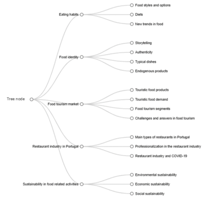
Figure 2 | Tree node of categories and subcategories used for the coding of the focus group transcription