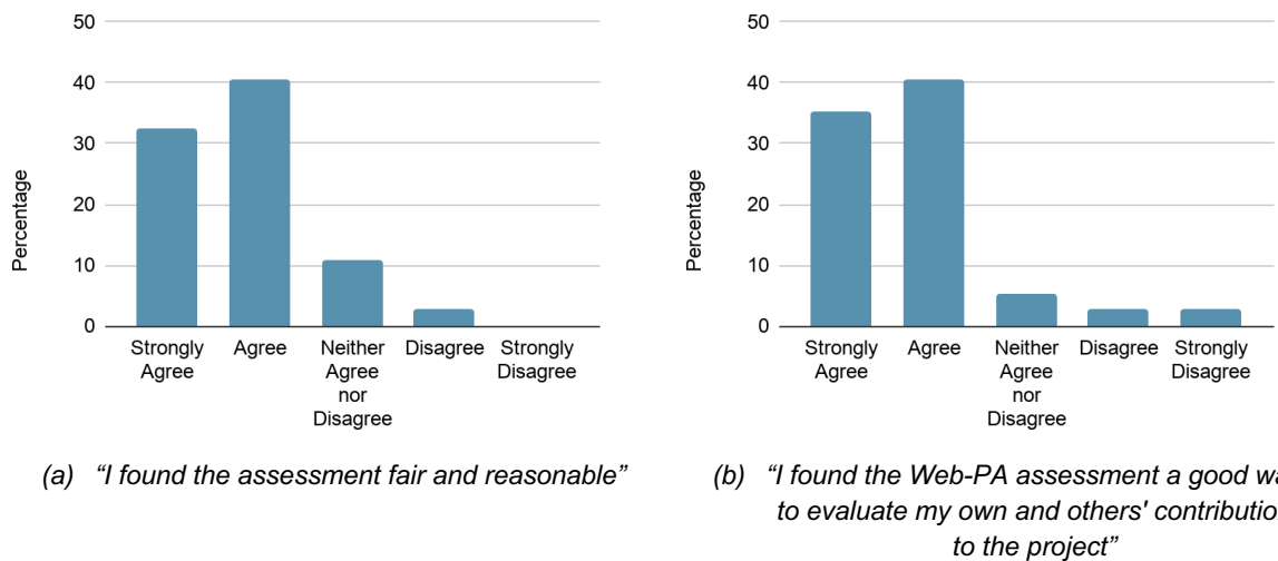
Figure 3. Quantitative evaluation of survey responses to two categories

“I liked the module, didn't feel overly stressful at times and being able to work in a group was useful to discuss any problems with it”