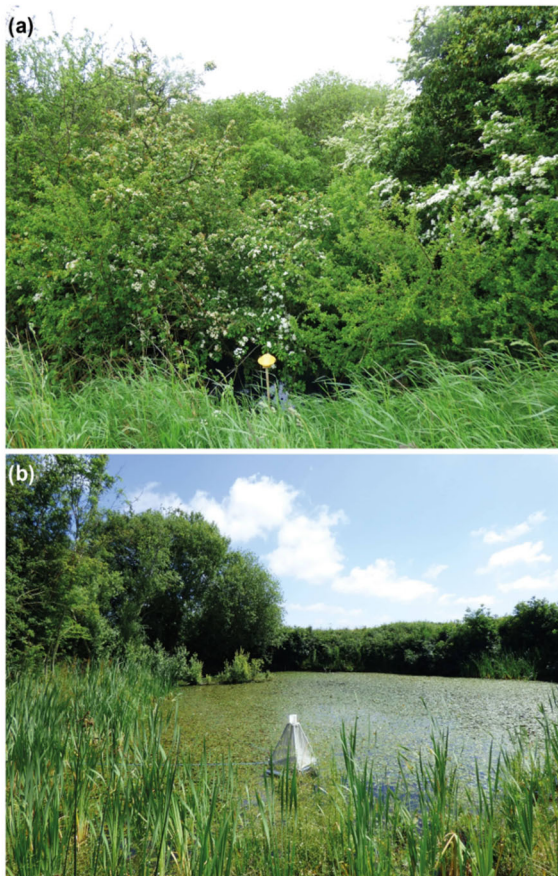
FIGURE 1 Overgrown unmanaged study pond (a) and open-canopy managed study pond (b)

Montebello, California, United States) with a Sound Devices Mix-Pre used as a mixer (Sound Devices, Madison, Wisconsin, United States). The hydrophone was submerged at least 20 cm below the surface,