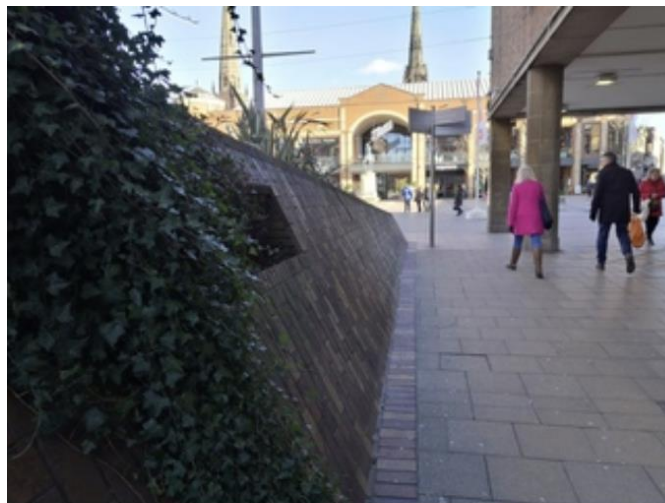
Wrapping the Materiality

The architecture students used the tool and the Dancing Bodies in Coventry archive to explore Coventry as an embodied place, whilst not losing sight of their own architectural perspectives. Each architect explored the city through a psychogeographical lens loosely based on the Situationist-inspired drift or dérive , the unstructured wandering and attunement to hidden places and narratives of place. Bridger et al. suggest that psychogeographical practices are playful and political. They “explore the conscious and unconscious effects and impacts of environments—how we make sense of the world”—and prompt us to imagine a world “beyond the consumer capitalist order of things.” (2016: 44) The students’ psychogeographic drifting and reimagining of the city is captured in the visual scores they curated and documented through the MovesScrapbook tool. The images below draw attention to these two walking scores.