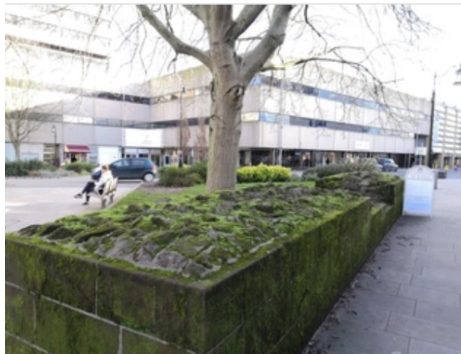
Sandstone change into Green texture Material