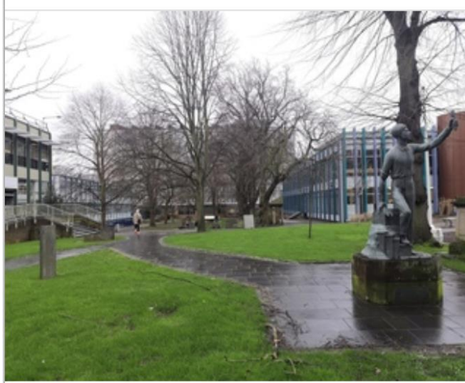
Movement around the Curved landscape