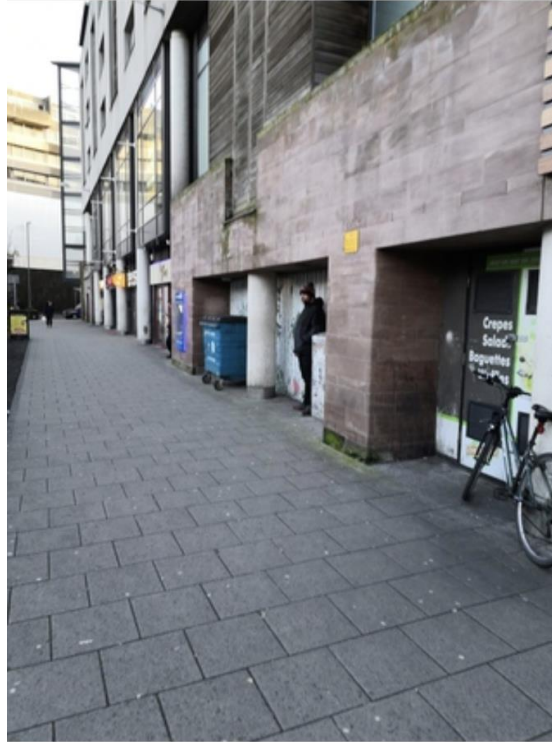
Culture of Niche Space in Coventry