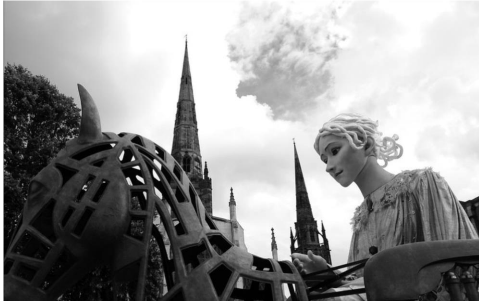
Figure 1: Godiva Awakes , Imagineer Productions [2020] Coventry City Centre (Coventry, UK).

This multimedia project (DBiC) serves as a first step towards building an archive for the rich history and ecology of dance in Coventry. The city has a deep history of dance that is understudied. The DBiC multimedia project aims to bring that history to light through a series of short films and related podcast episodes. The project provided an opportunity for artists, practitioners, dance groups, producers and academics to reflect on and revisit spaces within the city of Coventry. Filming took place in various locations throughout the city and the work encountered encompassed a variety of dance and movement forms, including Irish traditional dance, flamenco, rave, physical theatre, and vertical dance as well as more contemporary and somatic-based practices. Above all, the project was interested in how diverse dance and performance artists have taken to the city, how they breathe life into the city, and how they might help us to experience and sense it differently.