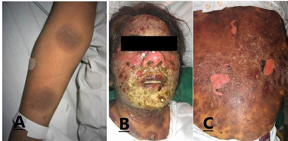
FIGURE 2: A. Fixed drug eruption on limb. B & C, Toxic epidermal necrolysis showing crusting and peeling of skin

24 (12.4%) were of Stevens-Johnson syndrome (SJS), 12 (6.2%) cases were of erythema multiform (EM), 20 (10.4%) cases were of urticaria, 11 (5.7%) cases were of fixed drug reaction (FDE) (Figure 2, A) and six (3.1%) were of toxic epidermal necrolysis (TEN) (Figure 2, B&C); 75% of patients with urticaria, EM, and SJS had CADR in <1 day as compared to FDE which showed the reaction in >1 day in 45.5% of patients. The frequency of CADR in TEN patients was the same for both as 50% of patients showed adverse drug reaction in <1 day and 50% showed in >1 day (Figure 3).