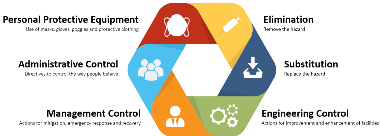
Figure 3. Multi-pronged strategy of controls [44].

With reference to the hierarchy of controls of the Centers for Disease Control and Prevention (CDC), a multi-pronged strategy comprising six aspects of controls (Figure 3) could be adopted to combat COVID-19 [44]. Undoubtedly, prevention is better than cure, and elimination and substitution are effective means of control to remove or replace the hazard (i.e., the coronavirus). This reduces the risk of infection and contains the risk of community outbreak, thus alleviating the pressure exerted upon the public healthcare system.