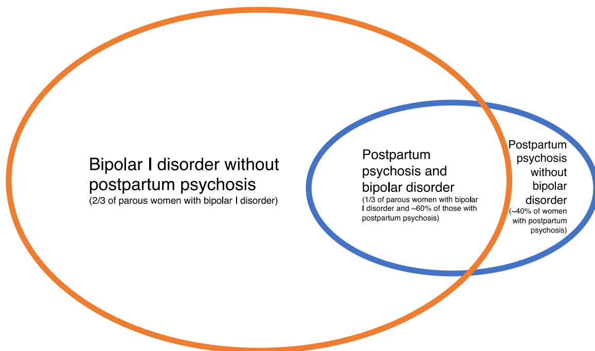
Figure 2: Lifetime relationship between bipolar disorder and postpartum psychosis. A lifetime diagnosis of bipolar I disorder in DSM-5 and ICD-11 includes three groups of women: 1) those with bipolar episodes outside of the postpartum only (orange), 2) those with both postpartum psychosis and manic episodes outside the postnatal period (intersection) and 3) women with postpartum psychosis only (blue). A small proportion of women with mania or psychotic depression after childbirth may be diagnosed with lifetime schizoaffective disorder or unipolar psychotic depression or bipolar II disorder. It has been estimated that about 1 in 3 parous women with DSM bipolar I disorder experience at least one episode of postpartum psychosis. On the other hand, while only 1 in 3 women with postpartum psychosis has an antecedent psychiatric history, mostly of major depression, over 40% will suffer from subsequent bipolar episodes outside the postpartum period.(29)

There are a number of women with history of bipolar disorder not associated with childbirth who subsequently suffer from postpartum relapse (Figure 2).