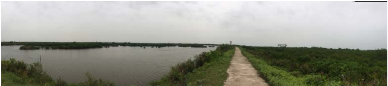
Image 1: A panoramic photograph of a walkway in the Xuan Thuy National Park.

As the two images iv below indicate, XTNP is a flat precarious landscape dominated by water. The level of land is marginal. The walkway in image 1 is 2m above water level while the beds of mangroves are just above water level. Any sudden or continual rise in water level can potentially radically transform the landscape. Image 2 provides an indication of the landscape through which people move in order to work and engage in other activities in their daily lives.