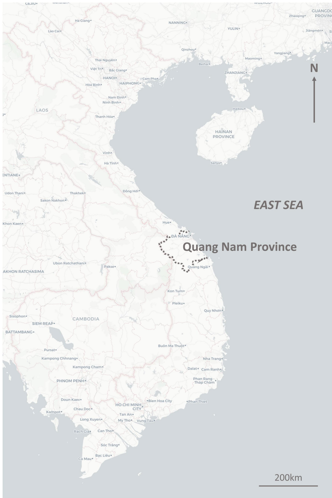
Fig. 1 Location of Quang Nam Province in Vietnam