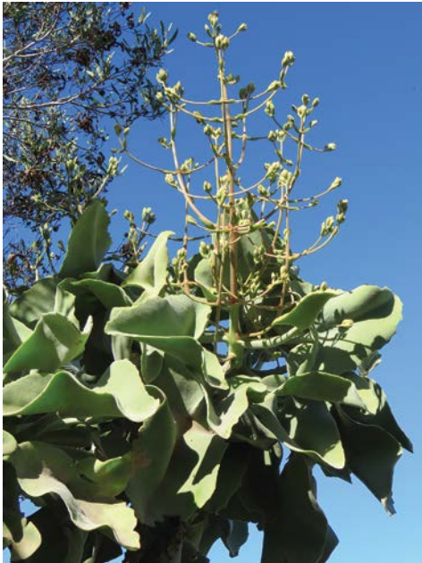
FIGURE 1.— Kalanchoe beharensis grows as small to medium-sized, erect to leaning, trees that can reach a height of 3 m. The form of K. beharensis most often encountered in South Africa has large, light bluish grey, velvety, boat-shaped leaves.

K. dinklagei (syn. K. brevisepala L.Allorge, the name used in Boiteau & Allorge-Boiteau 1995: 158) (see Smith et al. 2019a). Among other characters, K. beharensis is distinguished by having lateral inflorescences as opposed to the terminal ones of K. dinklagei .