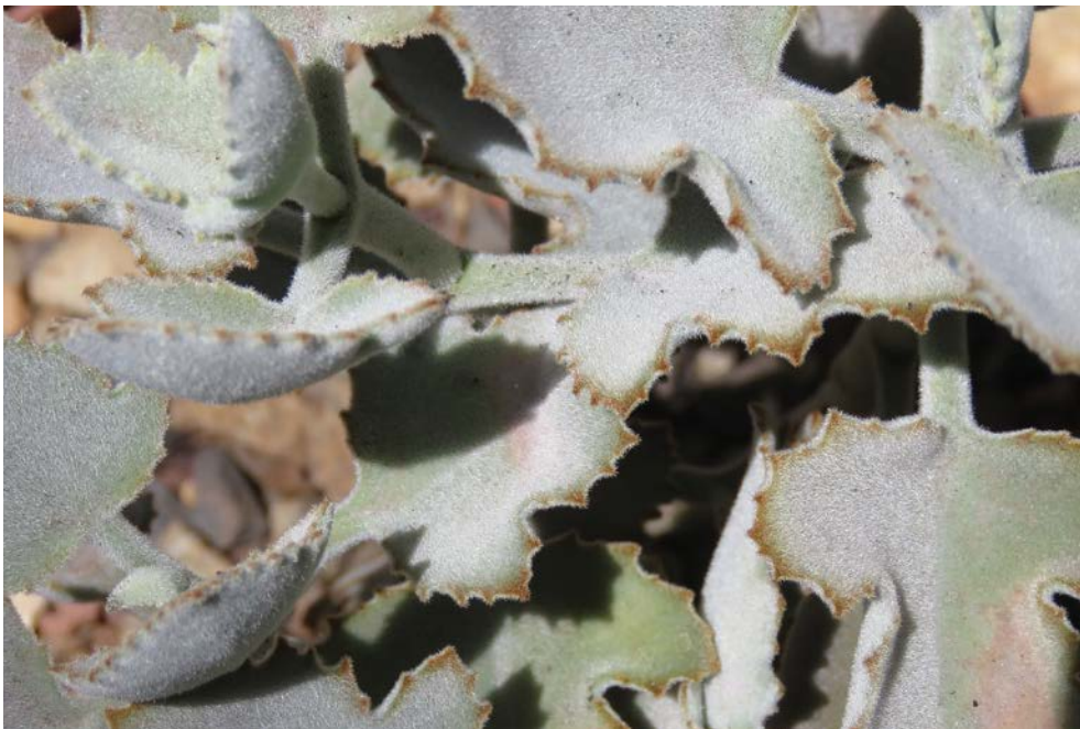
FIGURE 6.— Kalanchoe beharensis and K. millotii are the parents of the nothospecies K. ×hummeliae, pictured here.