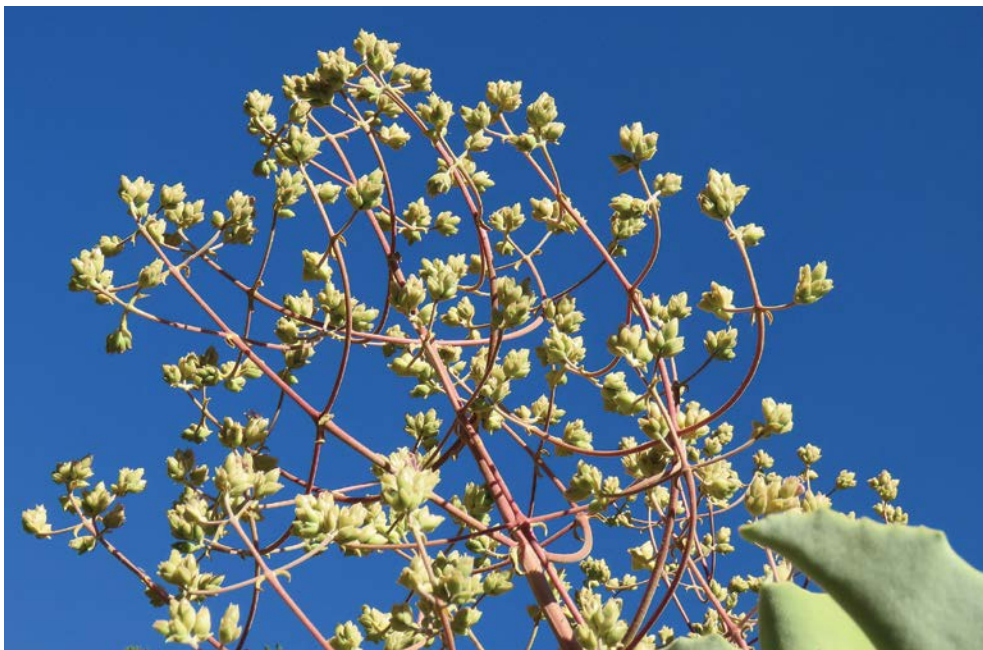
FIGURE 8.—Portion of an inflorescence of Kalanchoe beharensis . All the parts are finely tomentose. The recurved corolla lobes are distinctly purple-striped.