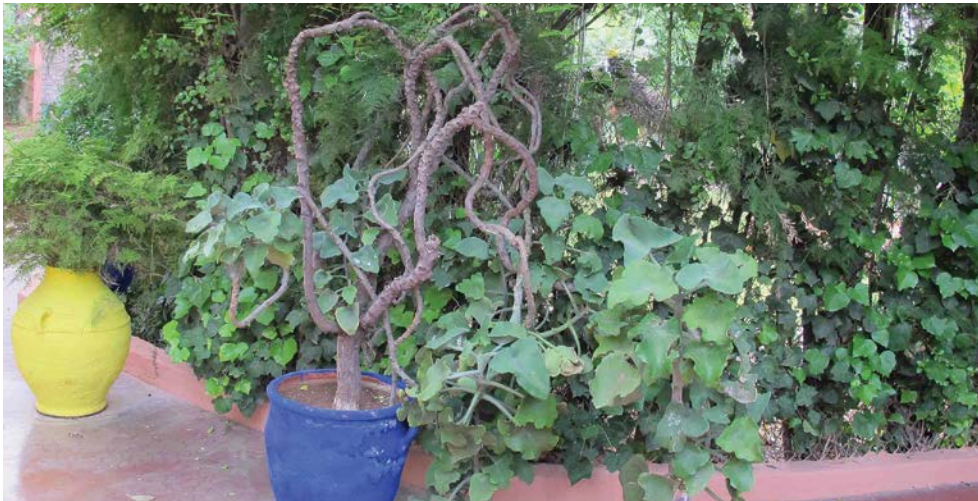
FIGURE 2.—The form of Kalanchoe beharensis variously known as ‘var. subnuda’ (‘Subnuda’) or ‘var. aureo-aeneus’ (‘Aureo-aeneus’) has leaves that are adaxially virtually glabrous. Photograph taken on 12 April 2017 in the Jardin Majorelle in Marrakech, Morocco.

Although Kalanchoe beharensis is a very variable species with numerous forms, having been variously treated as worthy of recognition as cultivars, none of these forms have been formally described at infraspecific ranks. Shaw (2008) provided a checklist of Kalanchoe cultivars in which an impressive 625 were tabulated, the majority named with their parental species, together with the name of the originator if known, references, and additional notes. For K. beharensis 17 named entities were included. Two designations that have never been validly published are sometimes encountered for material in cultivation: K. beharensis ‘var. aureo-aeneus’ H.Jacobsen, treated by Shaw (2008) as ‘Aureo-aeneus’, has leaves that are ad-