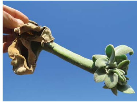
FIGURE 7.— Kalanchoe beharensis can be easily propagated from single leaves with intact petioles. Plantlets rapidly develop on the cut end of a petiole once the wound has sealed. The leaf blade slowly becomes desiccated as the plantlets develop.

Kalanchoe beharensis flowers from June to September (southern hemisphere), with a peak in July. The species is self-fertile and plants produce copious amounts of very fine, dust-like seeds that germinate very easily. The production of seed in significant volumes, the viability of the seed, and ability of new plants to grow from abscised leaves (Figure 7) or even from damaged leaves still attached to the plant, have contributed to K. beharensis having become established in southern Africa. The facility of K. beharensis to colonise new habitats even led Raymond-Hamet (1941) to speculate and conclude that the recorded presence of the species in Tanzania in East Africa as early as August 1910 was because it occurred there