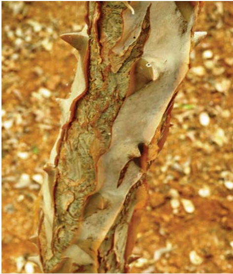
FIGURE 5.—The scars left where the leaves were shed lower down on the stems and branches of Kalanchoe beharensis are conspicuously edged with sharp points.

to the blade (Figure 4). Because of the distinctive shape, size and texture of the leaves of the species, common names recorded for it locally include donkie-oor and fluweelblaar in Afrikaans, and donkey's ear, elephant's ear ( kalanchoe ) and velvet leaf ( kalanchoe ) in English. Unlike several of the other, weaker forms of Kalanchoe beharensis , the one common in southern Africa grows very strongly and has become naturalised in a few places in the mild-climate eastern parts of the subcontinent (Smith et al. 2019b). The bark of K. beharensis is resinous (Jadin & Juillet 1912) and the stems, with their prominent 'spikes' left where leaves abscised, also lend interest to plants in cultivation (Figure 5).