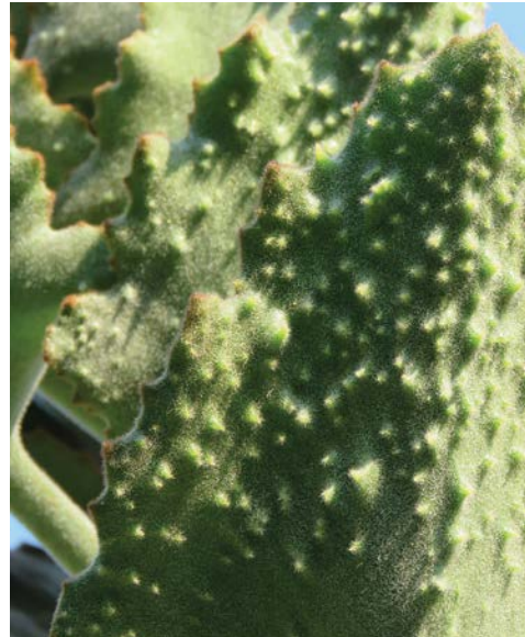
FIGURE 3.—Both the ab- and adaxial surfaces of the leaves of Kalanchoe ×edwardii 'Fang' are adorned with prominent protuberances.

The form that is encountered in cultivation in southern Africa is remarkably uniform in the expression of its characters: it has large, light green to glaucous leaves of which both surfaces are velvety and the basal 'wings' of the leaf blade stretch well past the point of attachment of the petiole