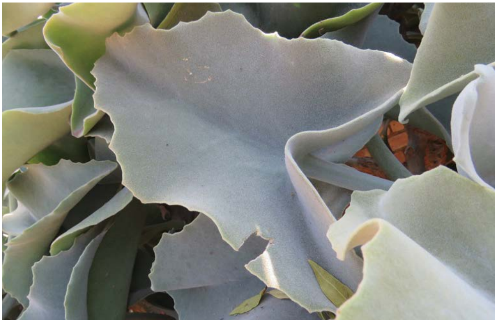
FIGURE 4.—The form of Kalanchoe beharensis widely cultivated in southern Africa has large, light green to glaucous leaves. The basal 'wings' of the leaf blade stretch well past the point of attachment of the petiole to the blade.