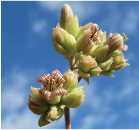
FIGURE 9.—A cluster of flowers of Kalanchoe beharensis . In the bud stage the corolla are virtually entirely obscured by the sepals. Photograph: G.F. Smith.