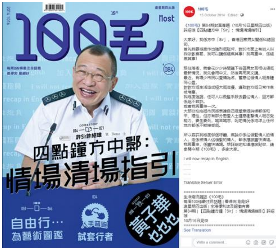
Figure 2: Cover of 100Most