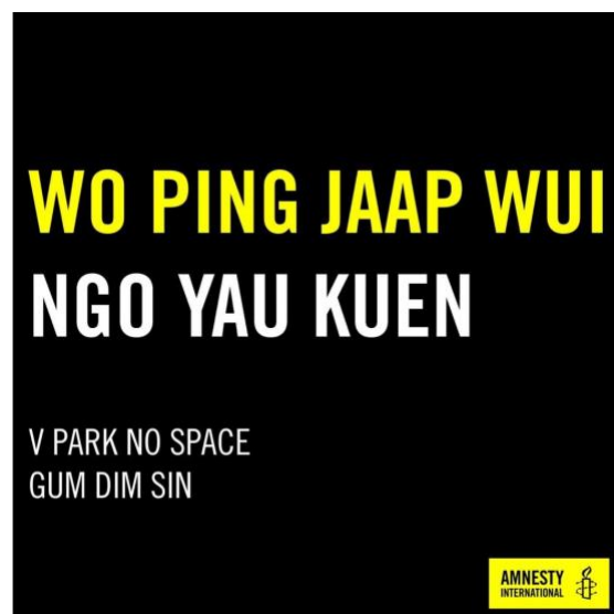
Figure 5: Poster by Amnesty International

Finally, as with the language mocking described in Section 3, this metalinguistic tactic, which began online, found its way onto the streets, with protesters at the August 18 rally and subsequent ones displaying signs in Romanized Cantonese such as that pictured in figure 6, which says “ HEUNG GONG YAN YIU JAANG HEI GA YAU ” (‘Hongkongers, hold our heads high, add oil’ 2 )