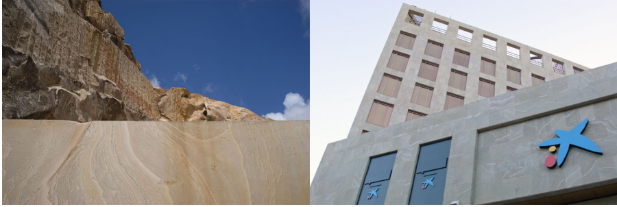
Figure 3. The extraction and commodification of trachyte: (left) one of Tindaya's quarries, and (right) CajaCanarias (now CaixaBank) headquarters in Tenerife.

Energy and Industry. 3 In February 1983, a thirty-year mining licence was granted to Cabo Verde Inc., allowing the company, based in the island of Gran Canaria, to extract its rock for ornamental purposes. There and then, the mountain's trachyte became a natural resource, or, more precisely, part of a 'resource environment': that is, 'the complex arrangements of physical stuff, extractive infrastructures, calculative devices, discourses of the market and development, the nation and the corporation, everyday practices, and so on, that allow ... substances to exist as resources' (Weszkalnys & Richardson 2014: 7). The mining licence produced a significant shift in the mountain's existence: whilst it already supported small-scale economic activities such as goat herding, quarrying required new forms of imported expertise and labour, 4 and more importantly transformed its rock into a commodity. Soon after, it would start to feature in institutional buildings across the archipelago, such as Fuerteventura's Airport and Courthouse or the CajaCanarias Bank headquarters in Tenerife (see Fig. 3).