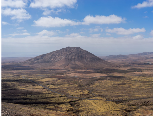
Figure 1. The mountain of Tindaya.

was both legally protected and exploited. Eduardo Chillida's proposed Monument was presented in 1995 as the state's solution to this duality: it would honour the mining rights by redirecting the quarrying towards the interior of the mountain, thereby 'protecting' the engravings and the environment from 'indiscriminate' mining. The proposal galvanized a small but determined group of activists who formed the Coordinadora and led a relentless campaign against the Monument and for the 'full protection' of the mountain, its environment, and its indigenous heritage. In contrast to the prosperous futures the state attached to the construction of Chillida's monumental cave, activists saw in the latter a 'symptom' of the authorities' slavish attachment to the dogma of tourism development and its utter disregard for pre-Hispanic heritage. Twenty-five years later, the stakes of the controversy remained essentially the same. For the state, Chillida's Monument still represented the possibility of a 'turning point' for Fuerteventura; for the activists, it stood as Tindaya's biggest threat.