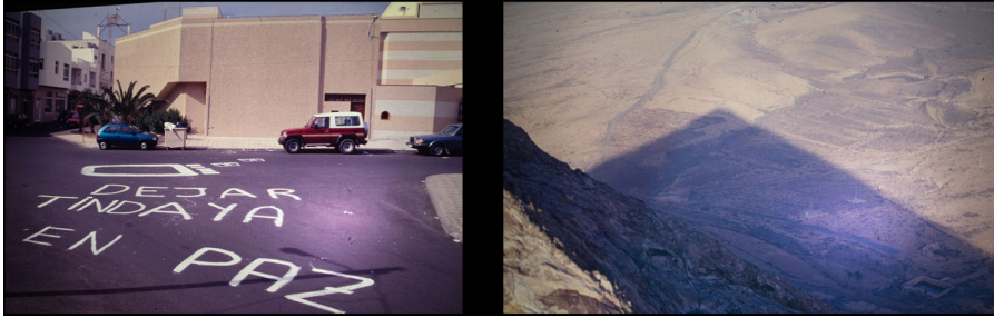
Figure 7. Activist juxtapositions: (left) graffiti ('Leave Tindaya alone') and (right) a view of Tindaya's shadow from the mountaintop.