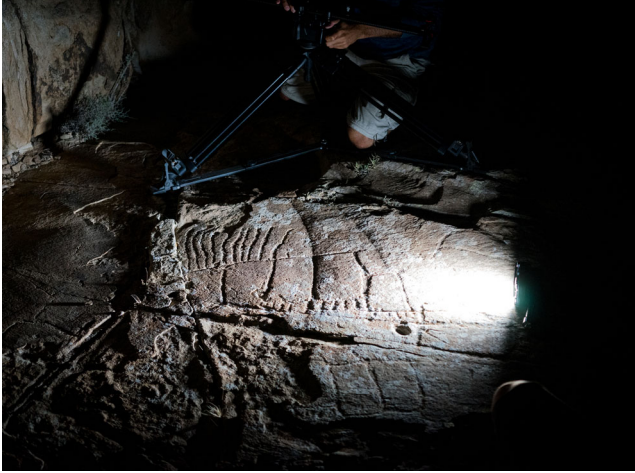
Figure 2. Tindaya's foot-shaped indigenous engravings.

evidence in the Sahara Desert and Northern Africa, where similar engravings were well documented, and the religious significance of the mountain, as indicated by the engravings themselves: