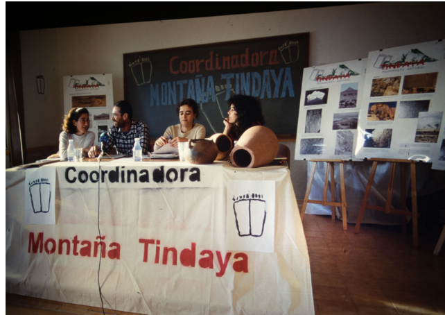
Figure 6. Coordinadora Montaña Tindaya's inaugural press conference, January 1997.

was necessary and urgent. They set up a working group, invited others to join them, and soon after the Coordinadora was launched with a press release and a series of campaign posters (see Fig. 6).