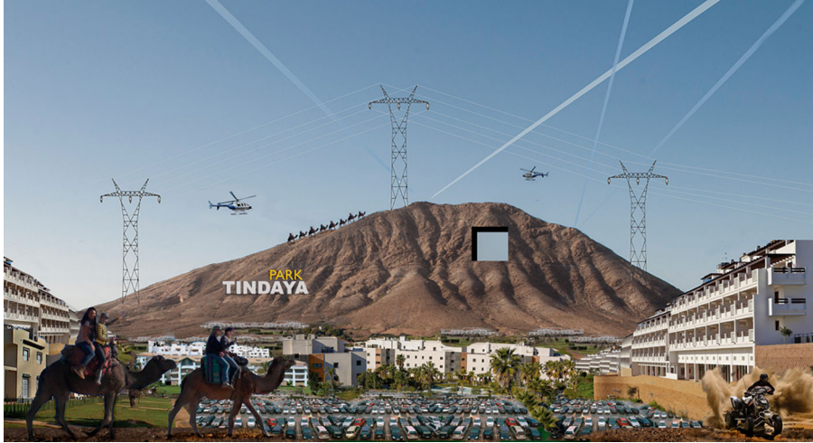
Figure 9. An activist's impression of Tindaya's future as a tourist resort.

I often heard that the Monument 'would be good for the island', that 'it would provide jobs and opportunities for young people'.