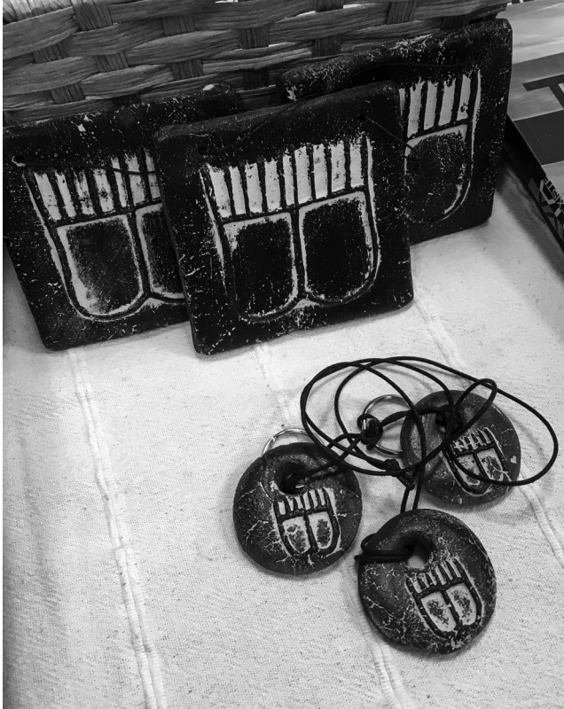
Figure 8. Activist merchandise featuring the engravings.

Hundreds of years ago, the Maho people fell in love with a mountain. Its colour, its remarkable shape, its location in the landscape, the way it sees off the sun each day ... it all caught the attention of the indigenous population, who chose it as the place to look for answers and find hope. They took care of it, revered it; they tattooed hundreds of feet on its skin. And they gave it a name: Tindaya ... [The powers that be] have perverted the law, unprotected its value, ignored its history and its incomparable heritage. But they haven't been able to silence the voices that defend it; Tindaya's history is the history of a proud and conscious people who will not capitulate before the power of money and ignorance ... This is why we are here, and will continue to be until we achieve the complete protection of the mountain, until we have absolute certainty that future generations will be able to learn from and admire the beauty of a mountain that speaks to us with its [engraved] feet, its greatness and its placid gaze towards the horizon. And we will not be moved until the establishment acknowledges what the people already know: that the monument already exists! [ general applause ]