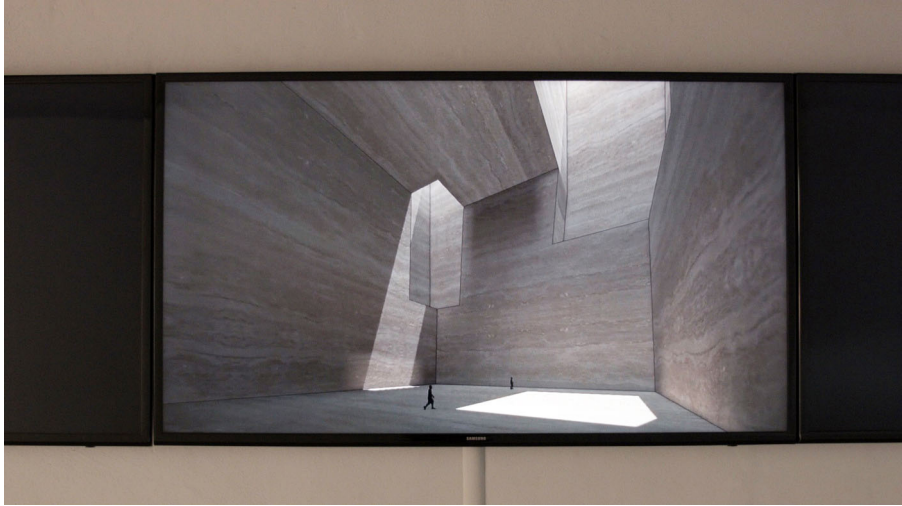
Figure 4. Casa Alta Museum, detail of multi-screen, 3-D simulation of Chillida's Monument.

interest. Drawing from Joseba Zulaika's (1997) analysis of the politics surrounding the construction of the Guggenheim-Bilbao Museum, I would argue that politicians were 'seduced' by Chillida's project, 'lured' by the prospect of being associated with a work of great impact and visibility. Indeed, PRAC's SPP was shelved shortly after, and the government focused instead on the development and promotion of Chillida's Monument – a decision that brought with it new and major challenges.