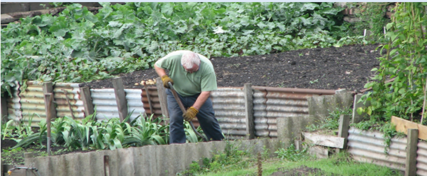
Care Homes in the Community - Evaluation

Alive have now stepped back from the project and Bamfield Lodge's Activity Coordinator is keen to keep visiting the allotment once the weather has got warmer and there are plans for the allotment site representative to visit the home and run a honey tasting session, with honey from his hives.