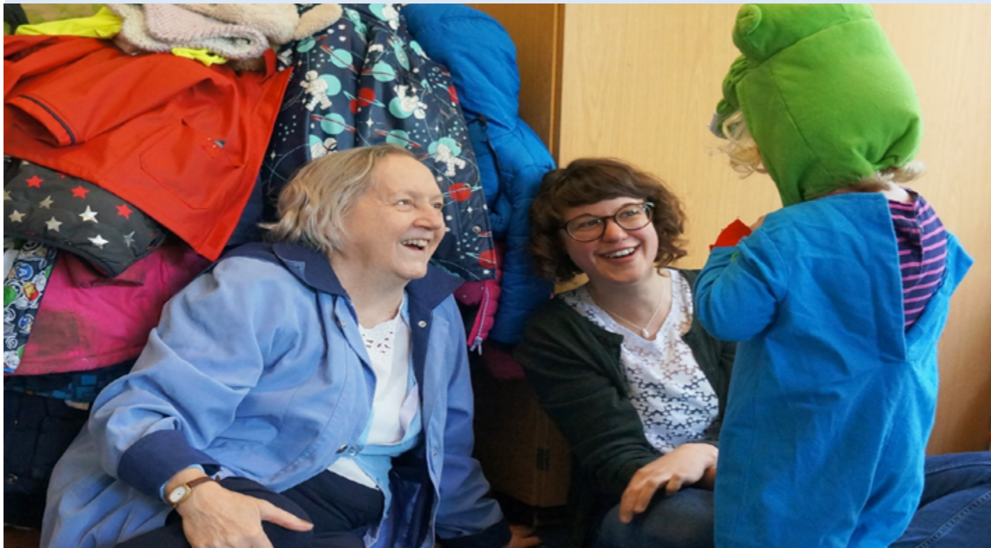
Care Homes in the Community - Evaluation

Since this connection first came about over 40 visits to and from the nursery to Stokeleigh have taken place. One of these sessions included a joint trip to Windmill Hill Community Farm - a third community link - who provided a group tour and a cookery workshop for participants.