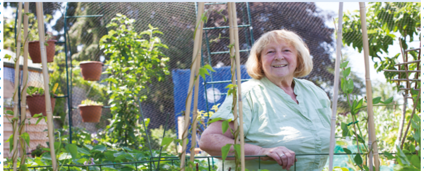
Care Homes in the Community - Evaluation

She next aims to “get it so everyone can take part in it” , with ideas including a spring bulb bed, rockery and sign explaining to visitors the species in her Wildflower garden and residents' ownership of the garden.