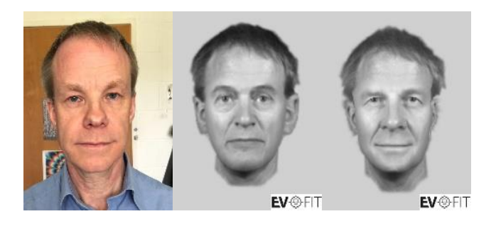
Fig. 1. Example target and composites from Experiment 1, left from a participant using EvoFIT Online and right from a participant using Witness At Home. These two composites were named at 75% and 92% correct, respectively.

b) Witness At Home Construction Stage: Participants worked online to construct the face: they initially viewed an instructional video and then completed face construction on their own. Procedures were equivalent to the EvoFIT Online procedure in terms of selecting the face database, smooth and textured faces, using holistic and shape tools, and adding external features. The researcher remained on hand to answer any questions a witness might have; in all cases questions were limited to procedural (e.g. should I press the 'next' button) rather than featural issues (e.g. do you think the nose is big enough). See Fig.1 for example composites produced in experiment 1.