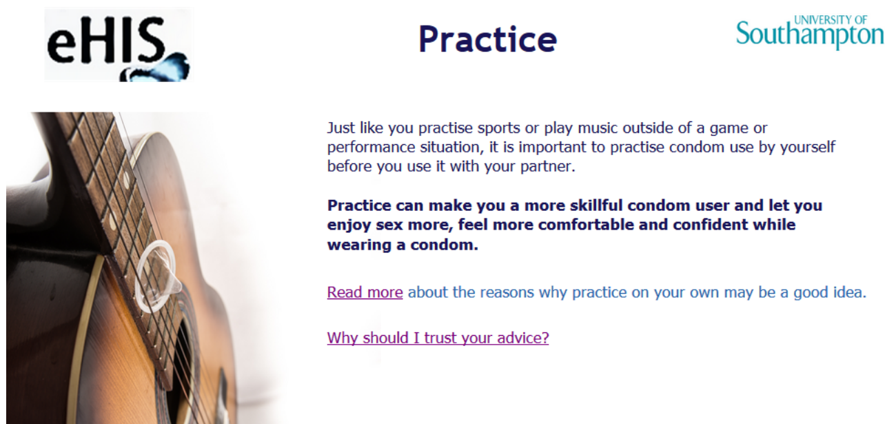
Figure 1. An example of a page on the Homework Intervention Strategy (eHIS) website.