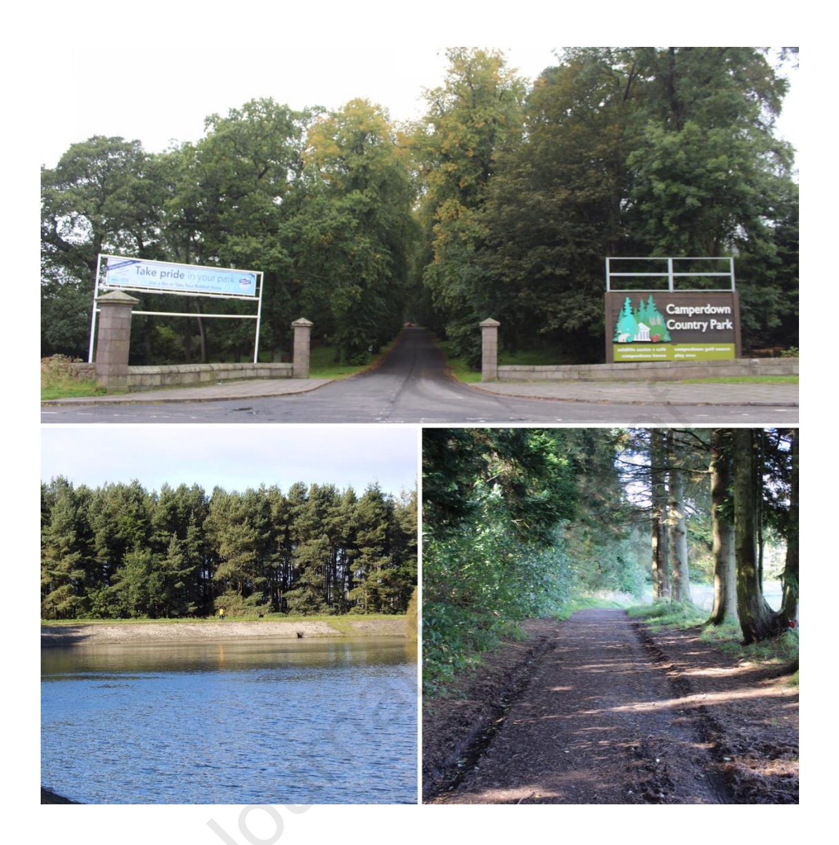
Figures 5a An example of the Open Spaces photographed Figure 5b Entrance to Forest Park and Figure 5C Reservoir.