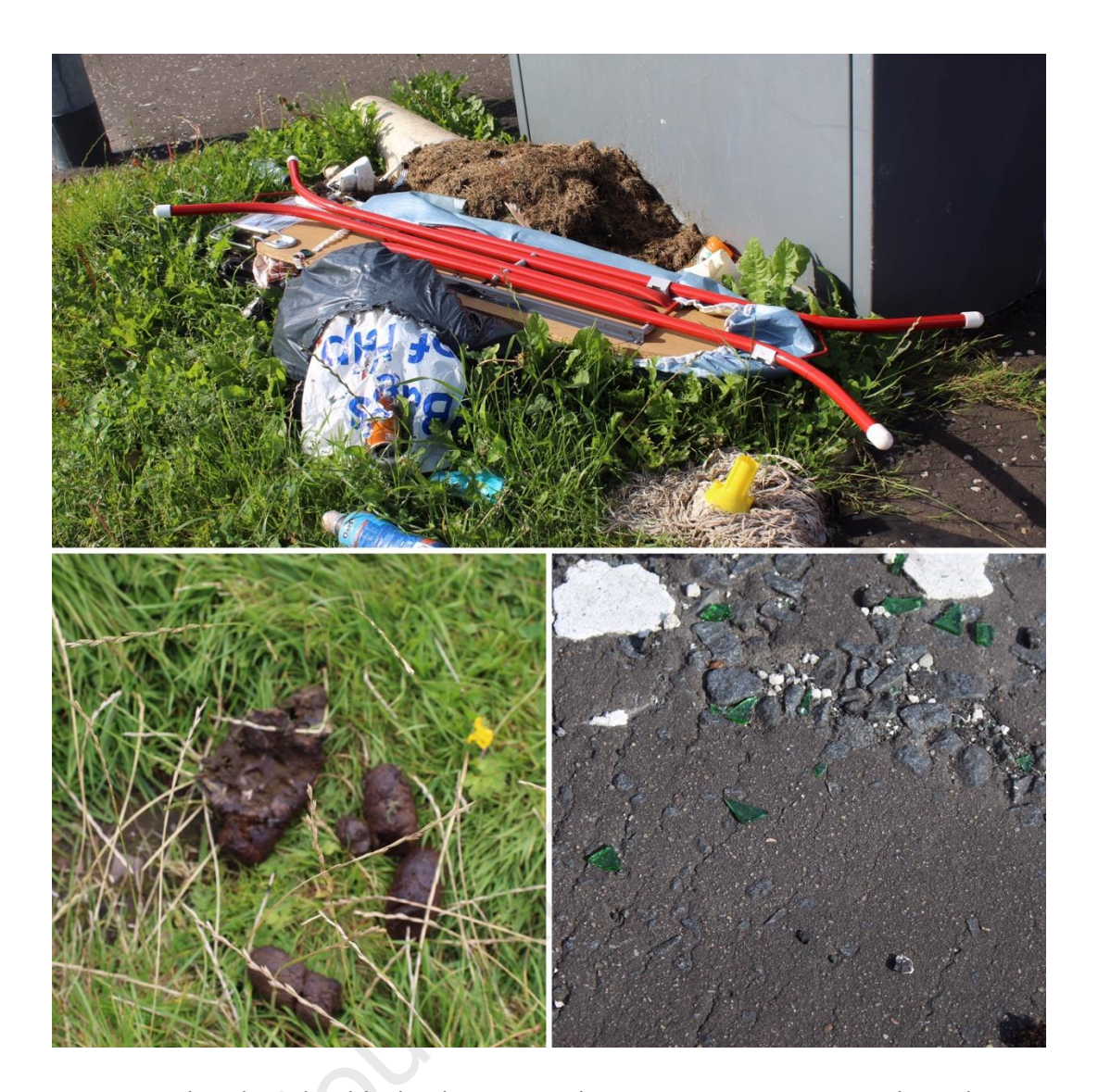
Figure 4a Abandoned Rubbish Piles Figure 4b Dog Waste Figure 4c Broken Glass