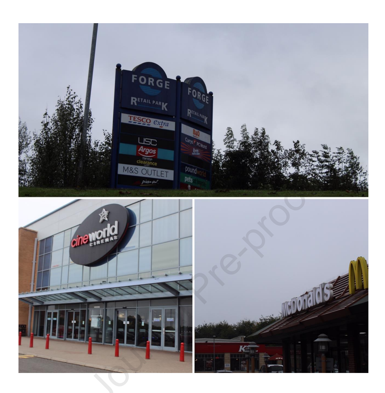
Figures 6a The local shopping centre Figure 6b The Cinema and Figure 6c Fast Food