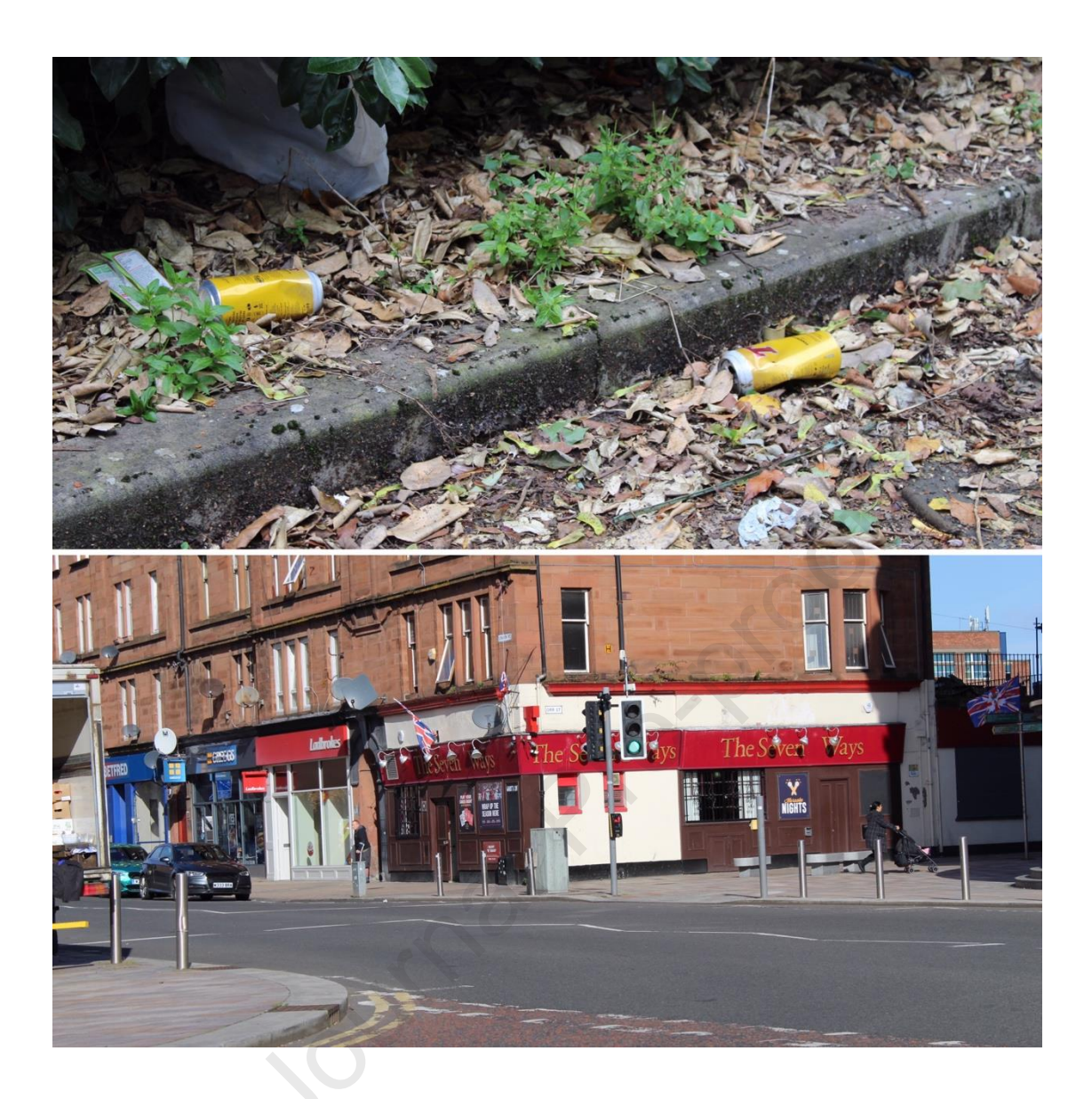
Figures 1a Substance misuse debris and 1b High numbers of licensed premises in the neighbourhoods