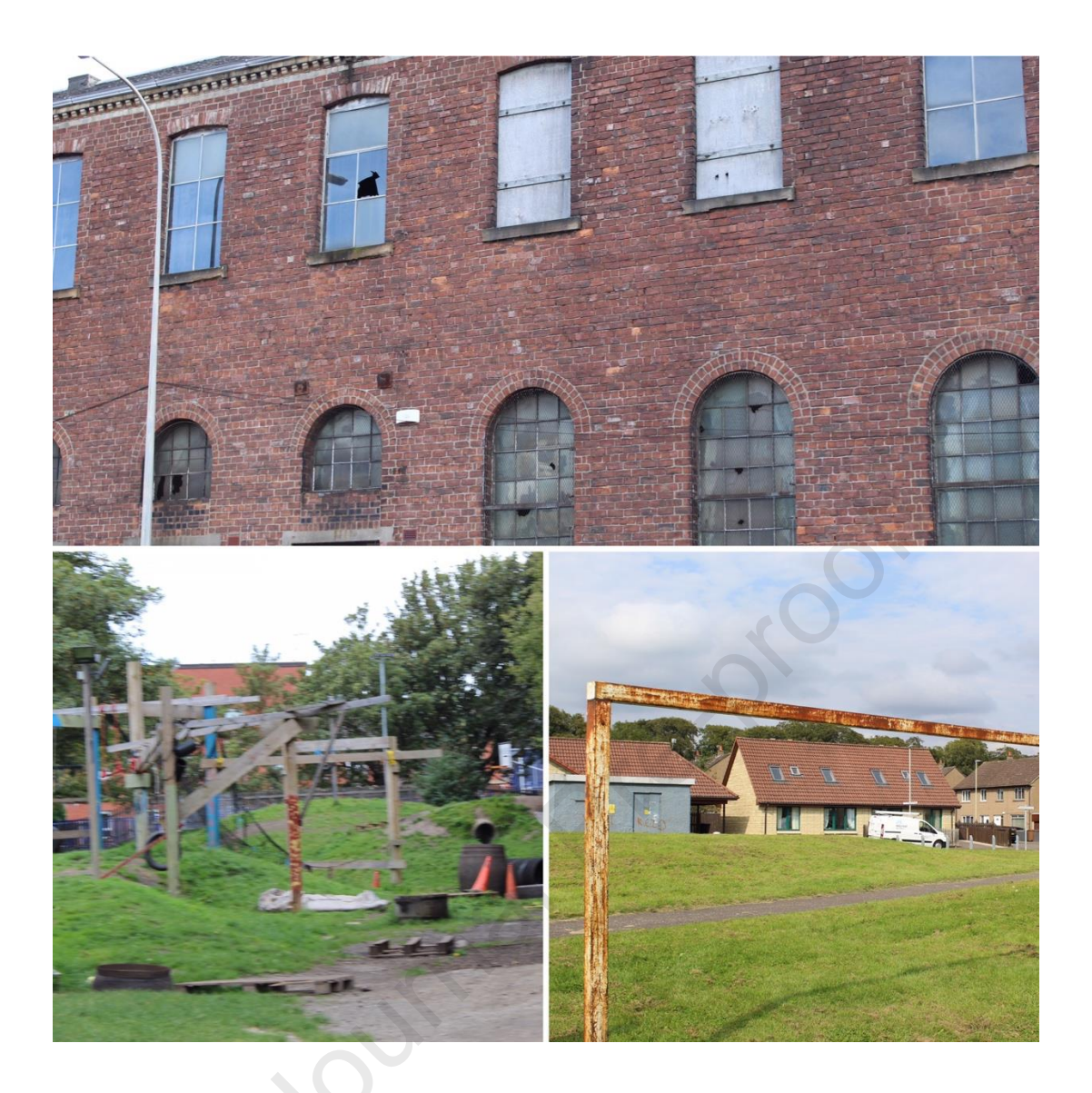
Figure 3a An abandoned metal factory, Figure 3b of the adventure park and Figure 3c Rusty play equipment