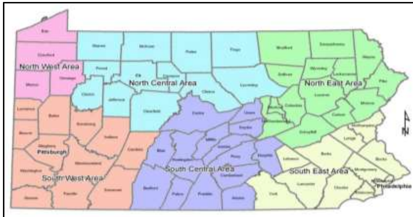
Figure 1. Pennsylvania SCORP Planning Regions

highest response rates were from the North Central (25.4%) and South Central (25.0%) regions of Pennsylvania. The lowest response rates were from more urban proximate areas such as Pittsburgh (16.8%) and Philadelphia (10.0%). Only consenting adults (18 years of age or older) were eligible to participate in the survey.