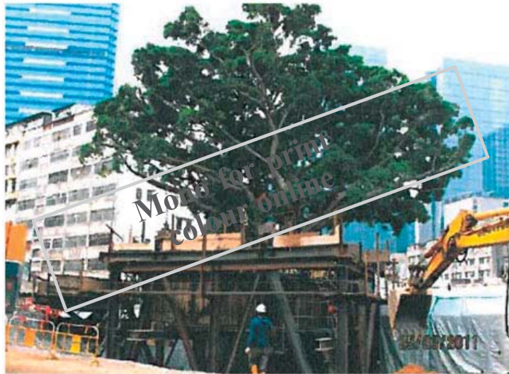
Figure 3. Yuet Wah Street Tree.