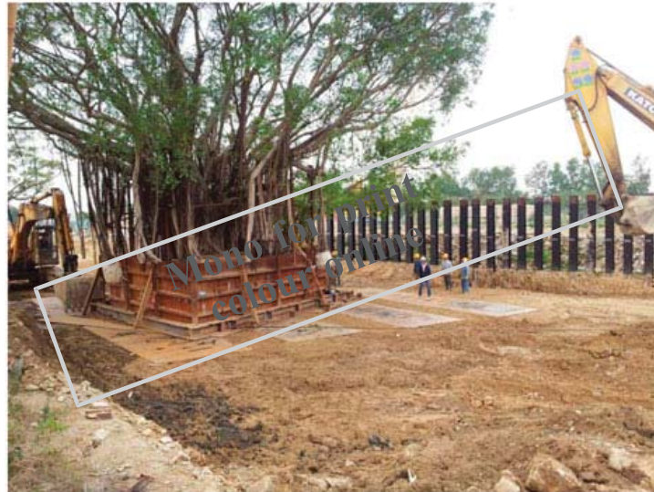
Figure 5. Cheung Chun San Tsuen Tree.

The tree was watered to field capacity daily, via holes drilled into the soil. As shoot growth was seen to be at normal levels during the spring season following final relocation, targeted irrigation was stopped except on dry days when the irrigation system of the surrounding ornamental landscape (approx. 5.0 L/m 2 /day) was used.