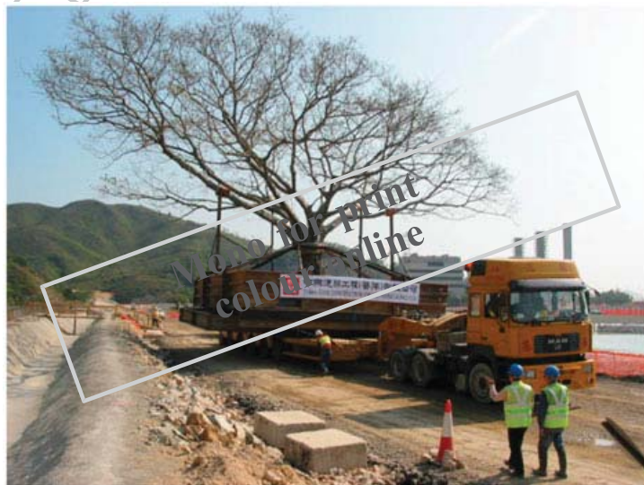
Figure 2. Penny's Bay Tree.

In January 2003, the tree was lowered onto a high capacity low loading truck and hauled 1200 m to a temporary holding location. The tree was maintained within its box and after seven months was relocated to its final location. Upon arrival to its final location, the tree was set on flat ground and the sides of the box were removed. A new landscape was constructed with imported sandy loam topsoil placed around the root ball to create a low mound some 25 m wide. The base plate was not removed due to concerns about the potential settlement. The porosity of the base plate, elevated position and sandy root ball soil were considered sufficient to ensure adequate drainage.