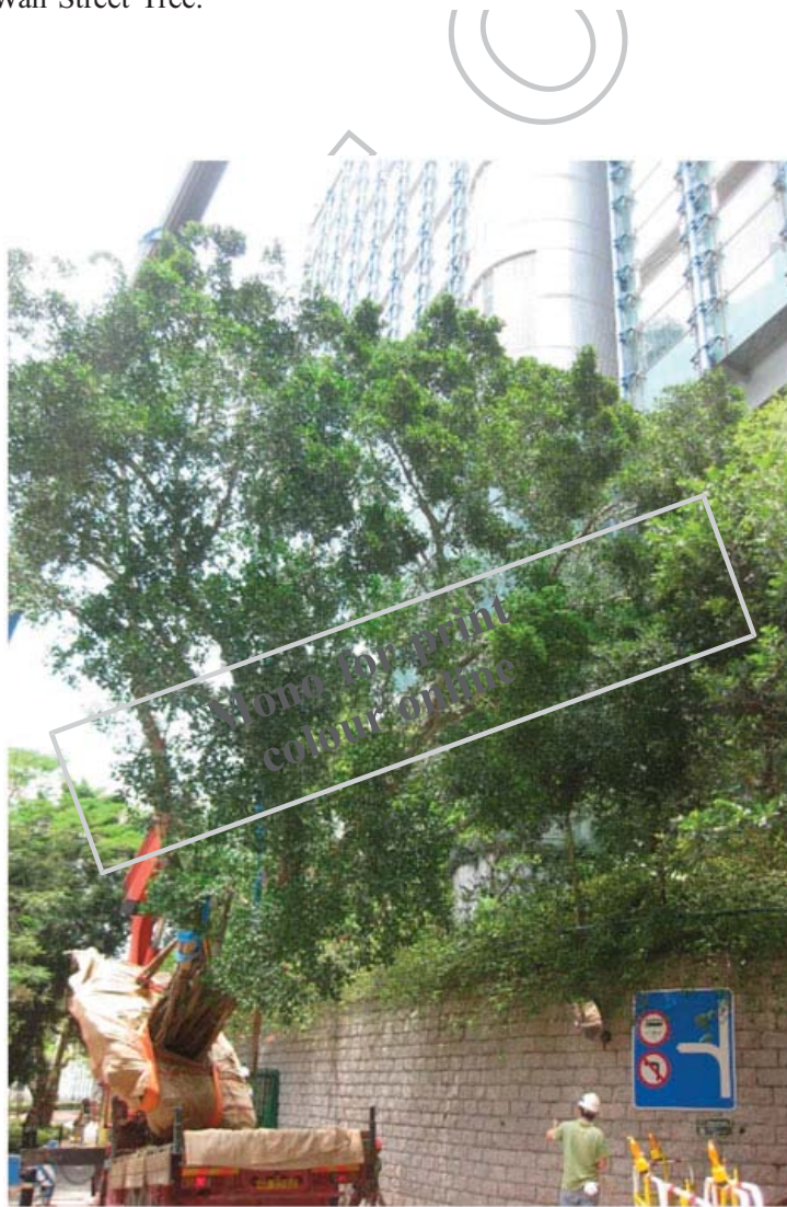
Figure 4. HKU Tree.