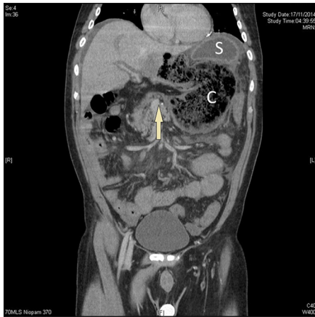
Figure 1. A coronal section of the CT scan showing the caecum (C) herniating through the foramen of Winslow (arrow), lying below the stomach (S).

internal herniae are associated with a high mortality rate. 3 Various types have hitherto been described, including paraduodenal, foramen of Winslow, transmesenteric, paracaecal, intersigmoid and paravesical. 4 Of these, protrusion through the foramen of Winslow represents 8% of internal herniae 1 and only 0.1% of all abdominal herniae. 5 This foramen forms the communication between the greater peritoneal cavity and the lesser sac. Its anterior border is the hepatoduodenal ligament and posterior border is the inferior vena cava. Its superior border is the caudate lobe of the liver and inferior border is the start of the duodenum and the hepatic artery. Several organs have been reported to herniate through the foramen of Winslow, including the small bowel, caecum, and ascending and transverse colon. 6 Involvement of the gallbladder, 7 small bowel diverticulum 8 or Meckel's diverticulum 9 has rarely been reported. Predisposing factors include an enlarged foramen of Winslow, failed retroperitonealization of the right colon, a long small bowel mesentery and a common intestinal mesentery. 6 Additional factors are a sudden increase in intra-abdominal pressure 10 and an atrophic greater omentum. 11 This disease has a male preponderance, affecting males 2.5 times more frequently than females, 12 with the greatest incidence between 20 and 60 years of age and a reduced likelihood at extremes of age. 13