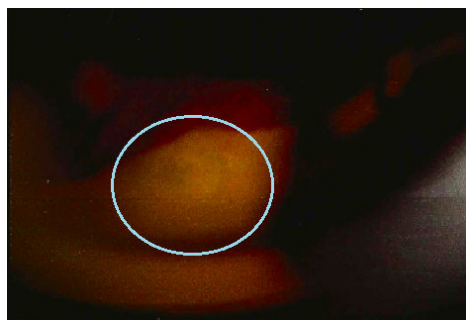
Figure 2: Gonioscopic finding showing the iridocorneal endothelial membrane obstructing the tube lumen.