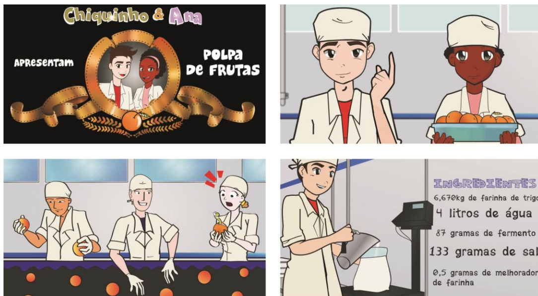
Figure 1 – Some animations flashes from food processing steps.

bread production. The topics chosen were previously agreed between Embrapa and direction of the educational partner institutions. Characters with a youthful appeal and national features have been developed. There were selected voice actors and produced texts describing step by step each food processing involved. The main characters were "Chiquinho" and "Ana" they participated in all the animations developed always showing how to produce food. It was created other characters in the stories to compose the text and counteract with the protagonists whenever necessary. The Figure 1 shows some of these actresses in action. These animations were intended to be used as supplementary education for training and for fix some concepts of FS&T.