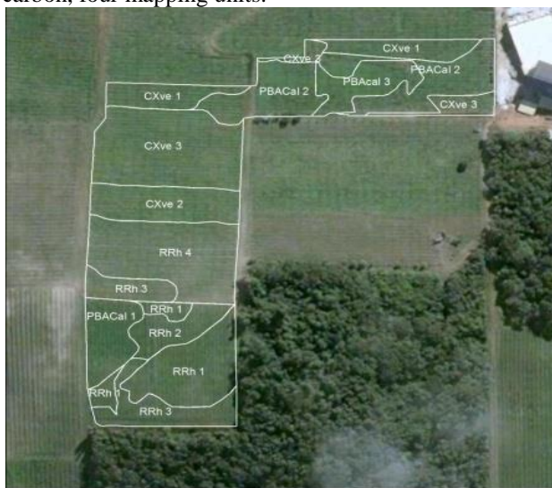
Figure 1. Vineyards map showing three taxonomic classes and 10 mapping units [4].

Based on the vineyard and grapevine coordinates and on the morphological and physicochemical properties of soils, it was shown that there are 10 types of soils in the 2.42 ha of vineyards (Figure 1) [4]. Indeed, there are three taxonomic classes – Argissolo, Cambissolo and Neossolo – and 10 mapping units. Argissolo (PBACal 1, 2, 3), characterized by high Al saturation, has three mapping units; Cambissolo (CXve 1, 2, 3), characterized by high saturation of bases, also three mapping units; and Neossolo (RRh 1, 2, 3, 4), characterized by high organic carbon, four mapping units.