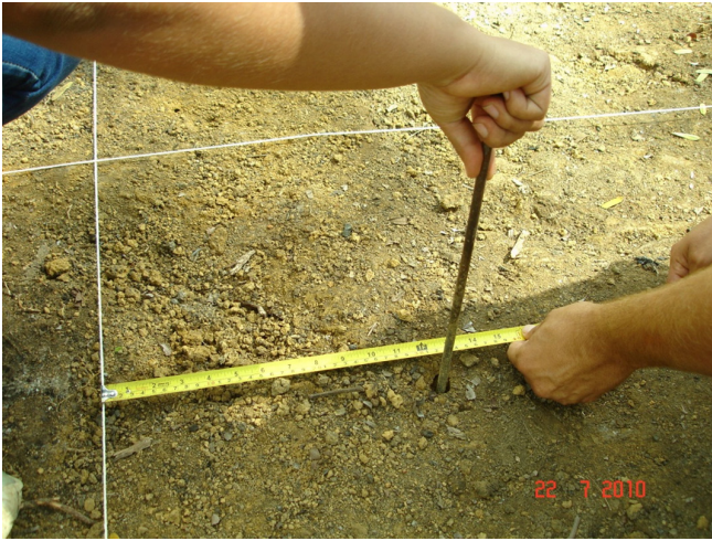
Figure 2. Measurement of the coordinates (X and Y) and depths (Z) of galleries of Q. gigas nymphs in parica plantation with the aid of a measuring tape and a metallic rod, respectively. Dom Eliseu, Para state, 2010.

data plotted and counting was performed. Supported by these values, we obtained the following indices of aggregation based on the variance-to-mean ratio (LUDWIG; REYNOLDS, 1988; KREBS, 1989), considered as an approach to determine the spatial distribution of nymphs: