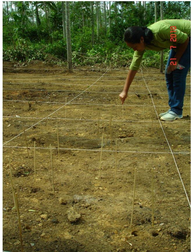
Figure 1. Marking of the galleries of Q. gigas nymphs in parica plantation with the aid of wooden sticks in the quadrats of the experimental area. Dom Eliseu, Para state. 2010.

After the spatial distribution of galleries was determined through these coordinates and the presence of nymphs was marked, each gallery was plotted with the coordinates of the trees aiming to establish a pattern of influence on the occurrence of cicadas. Later, specific grids were prepared based on the