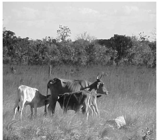
Figure 1 - Allo-suckling: Curraleira cow suckling her own calf, an orphan calf and a calf from the general herd.

A total of 571 cases of attempted suckling were observed, of which 87.1% (497) were successful. In 12.9% (74) of the cases suckling was attempted but not successful. Calf sex was not a significant factor ( X^2 = 0.57 ; P > 0.45 ) in determining the success of suckling (Table 1). The position of the calf relative to the cow significantly affected ( X^2 = 129.67 ; P < 0.0001 ) the success of suckling. When the calf nursed from the normal (lateral) position, suckling was successful 99.5% of the time. Attempts to suckle from behind were described in 136 cases, with 92 (67.6%) being successful. It is thought that as the calf trying to suckle from behind is out of sight, the dam does