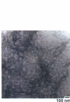
Fig 1: TEM of CNCs at 150 min

The incorporation of CNCs significantly changed the mechanical behavior of the material. The tensile strength of the natural rubber nanocomposites increased by about 50% compared with unreinforced film. This is an indication of good wettability and good interaction between the two components, allowing efficient stress transfer between the matrix and fibers. Tensile modulus of the nanocomposites increased and the elongation at break decreased approximately 50% with the addition of 10% CNCs.