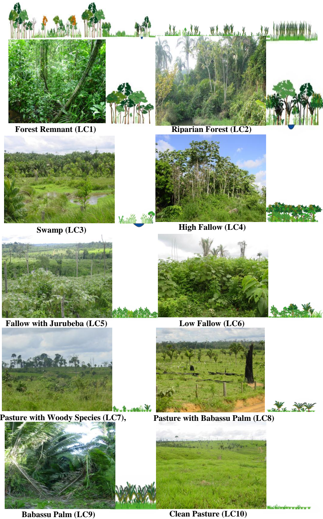
Figure 2. Landscape components of the SP-Benfica, southeastern of Pará State, Itupiranga municipality, Brazil.