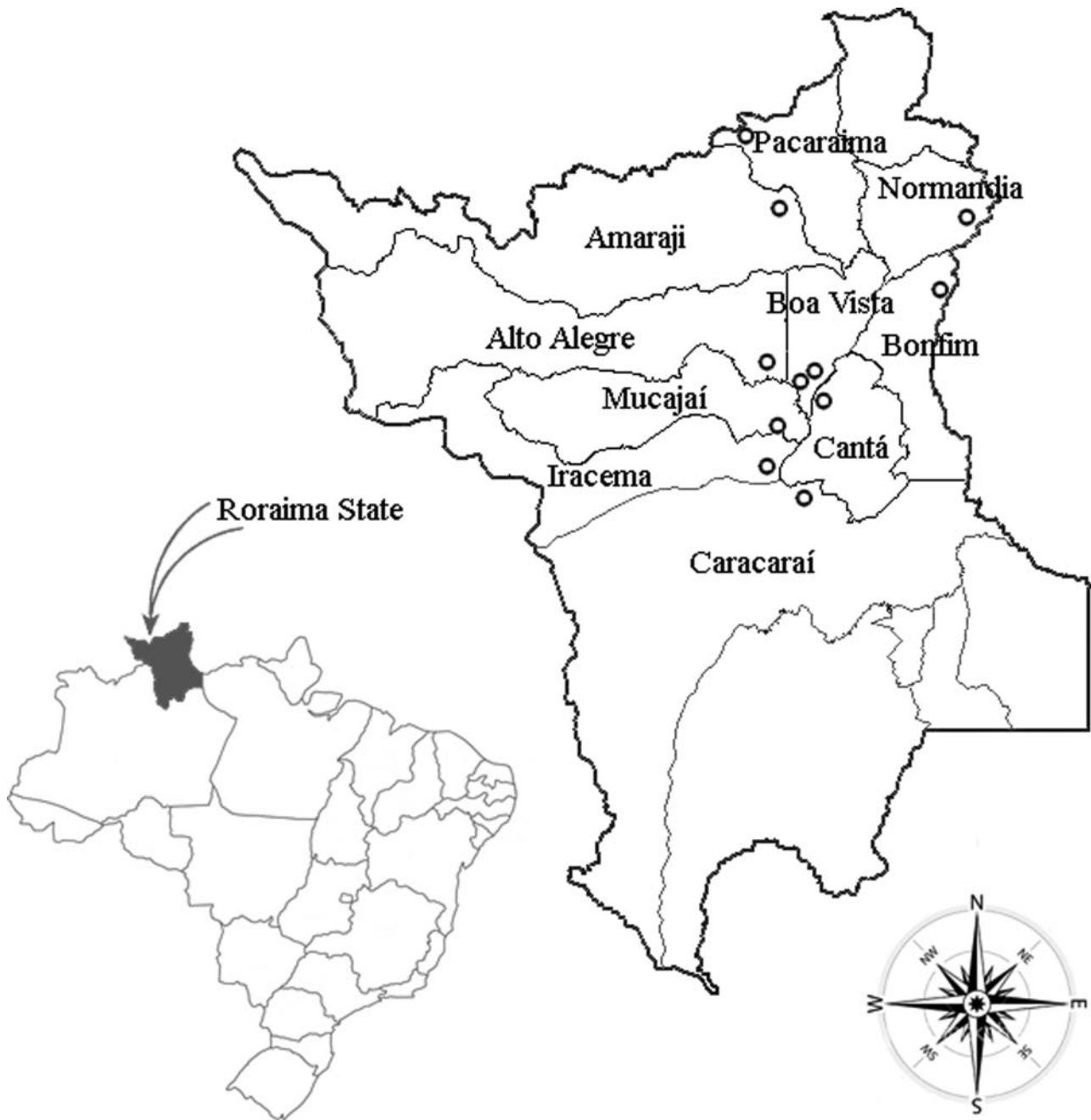
Fig. 1. Sites where Raiiella indica was found on different hosts between March 2010 and February 2011 in Roraima state, Brazil.

8.1 cm 2 , the two highest densities corresponded respectively to about 331 and 77 mites per leaflet. Densities reduced quickly after the first sampling date to levels below 0.04 mites/cm 2 , with the concurrent increased levels of rainfall and decreased levels of temperature (May–September). Upward trends in Raiiella population levels were observed between October–November and January–February, coinciding with and/or preceded by periods of low rainfall. Other phytophagous mites (57% of which represented by Tetrany-