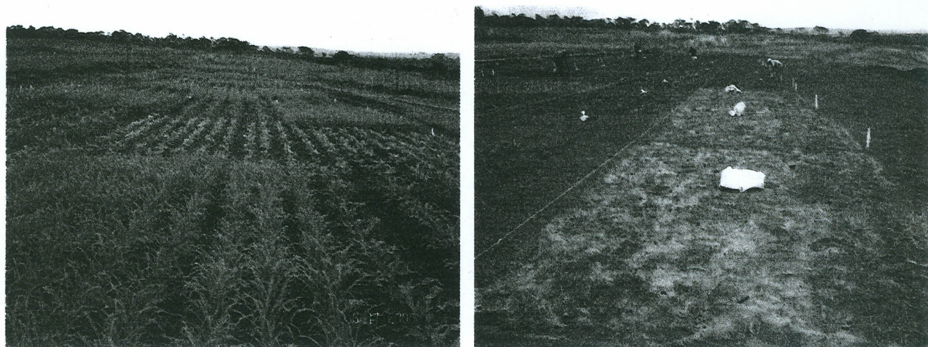
Fig 1. General aspects showing the Biotite schist applied on the soil surface (left) and pearl millet and soybean growing in the field (right).