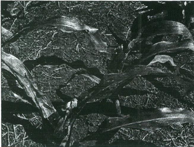
FIG. 1. Fall armyworm, Spodoptera frugiperda , damage on non-transgenic corn ( Zea mays L.) leaves.

Fall armyworm, Spodoptera frugiperda (Lepidoptera: Noctuidae), is one of the most important insect pests in Brazil. Its feeding damage (Figure 1) may reduce corn yield by up to 34% (2). Currently, chemical insecticides such as organophosphates, chlorpyrifos, and spinosad are used to control this pest in Brazil to reduce damage.