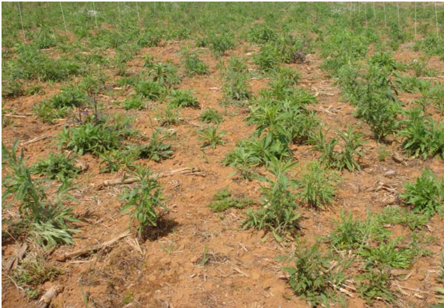
Fig. 1. Corn-soybean crop rotation area infested by Conyza bonariensis resistant to the herbicide Glyphosate, 2010, Castro / PR, Brazil.

advantage of the species is its way of spreading by the wind, allowing only one plant to spread its seeds kilometers away. This fact allied to its high seed production, 110 to 200.000 seeds for C. bonariensis and C. canadensis , respectively (Wu & Walker, 2004), its presence can reduce the soybean productivity up to 80%. The control of this species is linked, in the practice, to herbicides mixtures, with use of ingredients such as flumioxazin and chlorimuron-ethyl. However, research does not stop and new chemicals are being launched to assist North American and Brazilian producers in managing this species.