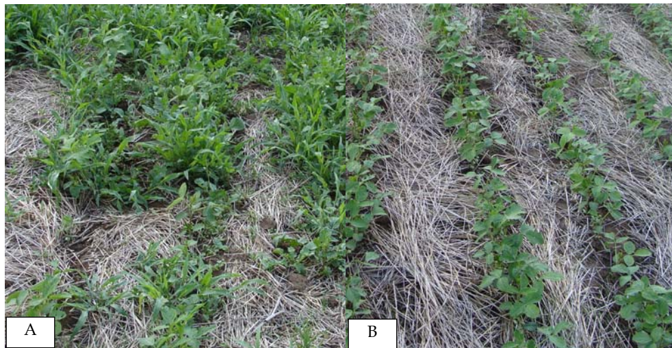
Fig. 2. A) No tillage system on soybean with application of glyphosate in an area with high seed bank Brachiaria plantaginea , in the beginning of soil system adoption - second year of cultivation. B) No tillage system of soybean with application of glyphosate in an area with crop rotation, during the sixth year of cultivation. Ponta Grossa/PR, Brazil.

which requires a further care during the establishment of the system. However, in the long term, its adoption is advantageous for it accelerates the decrease in the seed bank, enabling the uniformity of the seedling emergence and the effectiveness of control measures, especially the chemical.