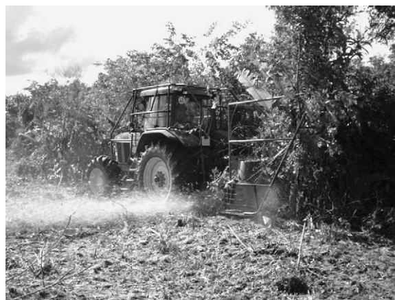
Figure 3. Tritucap II at work in 4-year-old fallow vegetation.

eight hours. As the speed of the operation is between 1 \text{ km h}^{-1} and 3 \text{ km h}^{-1} , the tractor has to be equipped with an inching motion facility.