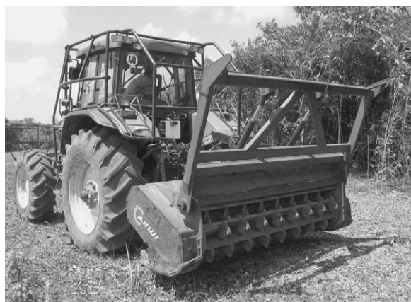
Figure 4. Forest mulcher AHWI FM 600.

may be more finely chopped in a second go. In this case, the tractor drives forward pulling the chopper. The rotor picks up the plant material from the ground and chops it again. Initially, we assumed that the chopping principle of the FM 600 would be suitable, as we expected heavy disturbance of the topsoil through the horizontally rotating rotor possibly destroying the upper root system thus impairing the regeneration of the fallow vegetation. This concern, however, turned out to be unfounded, if the tractor was operated by a well-trained and experienced driver.