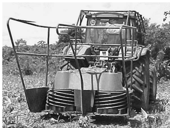
Figure 2. Newly developed bush chopper Tritucap II.

b Close to soil surface; n.a. = not applicable; biomass = fresh weight; AHWI = AHWI Maschinenbau GmbH, Herdwangen, Germany.