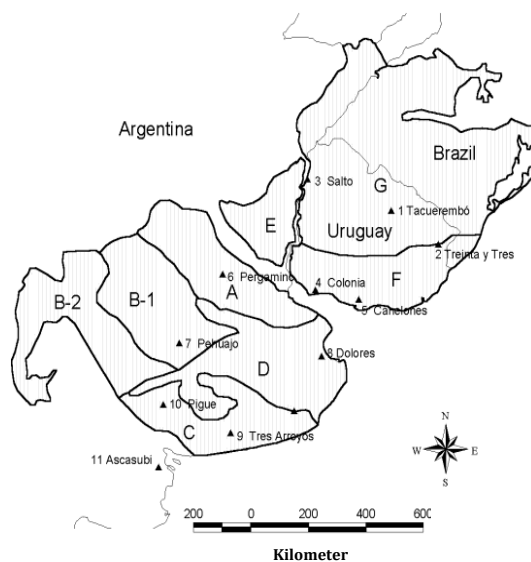
Figure 1. Natural grasslands from Río de la Plata. A. Pampa Ondulada, B. Pampa Interior, C. Pampa Austral, D. Pampa Inundable, E. Pampa mesopotámica, F. Campos del Sur, G. Campos del Norte. From Soriano (1991).

Pampa natural grasslands is part of the Río de la Plata natural grasslands (Carvalho et al., 2008), the largest natural grassland biogeographic unit in South America, and one of the largest in the world. The Río de la Plata natural grasslands occupy an area of 70 million ha (Figure 1), between eastern Argentina, Uruguay and Rio Grande do Sul, Brazil (Soriano, 1991; Pallares et al., 2005).