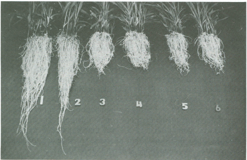
Fig. 1. Root development of maize populations grown in nutrient solutions with 241 \mu\text{mol Al L}^{-1} . Left to right: 1 = original 'Composto Amplo', 2 = selected 'Composto Amplo', 3 = Corn Belt \times Brazilian, 4 = Corn Belt \times Caribbean, 5 = Hays Golden, and 6 = Nebraska B Synthetic.

The decrease in variability of the selected 'Composto Amplo' population compared to the original 'Composto Amplo' was best demonstrated