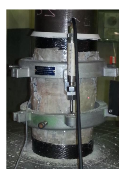
Figure 1. Test setup.

faces. Both ends of the specimens were wrapped using Fibre Reinforced Polymer (FRP) sheet for a width of 35 mm in order to prevent premature failure. To measure the axial deformation at the middle half of the cylinder, Linear Variable Differential Transducer (LVDT) was used. Displacement controlled loads were applied at 0.5 mm/min. An electronic data acquisition system was used to record the load and the corresponding axial deformation. Figure 1 shows a specimen in the testing machine.