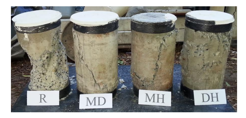
Figure 3. Typical failure modes.

The typical failure modes of the specimens are shown in Figure 3. The failure mode for Group R specimens was brittle. However, with the inclusion of different hybrid steel fibers into high strength concrete, the failure mode became a combination of shear failure and bugling of the specimens in the lateral direction. The failure mode of Group MD specimens was due to the propagation of cracks parallel to the loading direction. This means that Group MD was effective in reducing early cracks propagation and contributes little to post peak behavior. The failure mode of Group MH specimens was due to shear failure and bugling of the specimens in the lateral direction. This means that Group MH was effective in reducing early cracks propagation and in improving the post peak behavior of the specimens. The failure mode of Group DH specimens was due to bugling of the specimens in the lateral direction. This behavior shows that Group DH was more effective in the post peak behavior and has less contribution to arresting early cracks propagation.