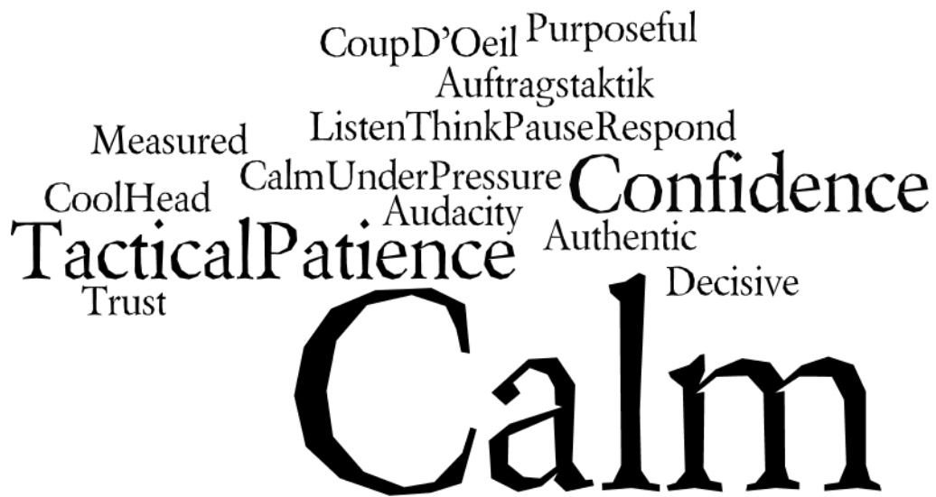
Figure 3. Word Cloud of Answers to Question 19. 75