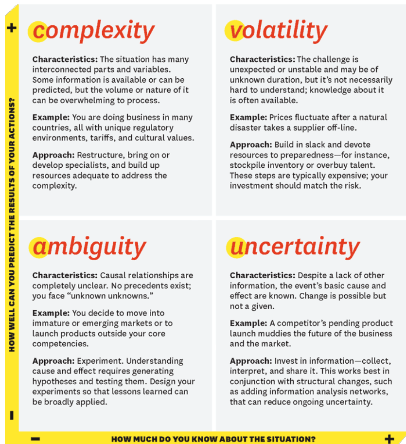
Figure 1. Depiction of VUCA Concept. 19