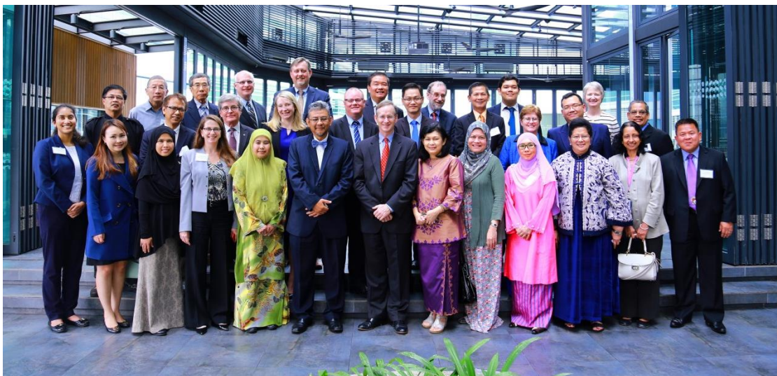
Participants of Biosecurity Dialogue in Kuala Lumpur

Dialogue participants made numerous remarks about the value of the Track II dialogue process, noting its utility in facilitating frank discussions of strengths and weaknesses, as well as opportunities to build collaborative working relationships. Meeting attendees also expressed broad interest in continuing the dialogue in 2016. The following sections describe key observations and findings from the meeting discussions.