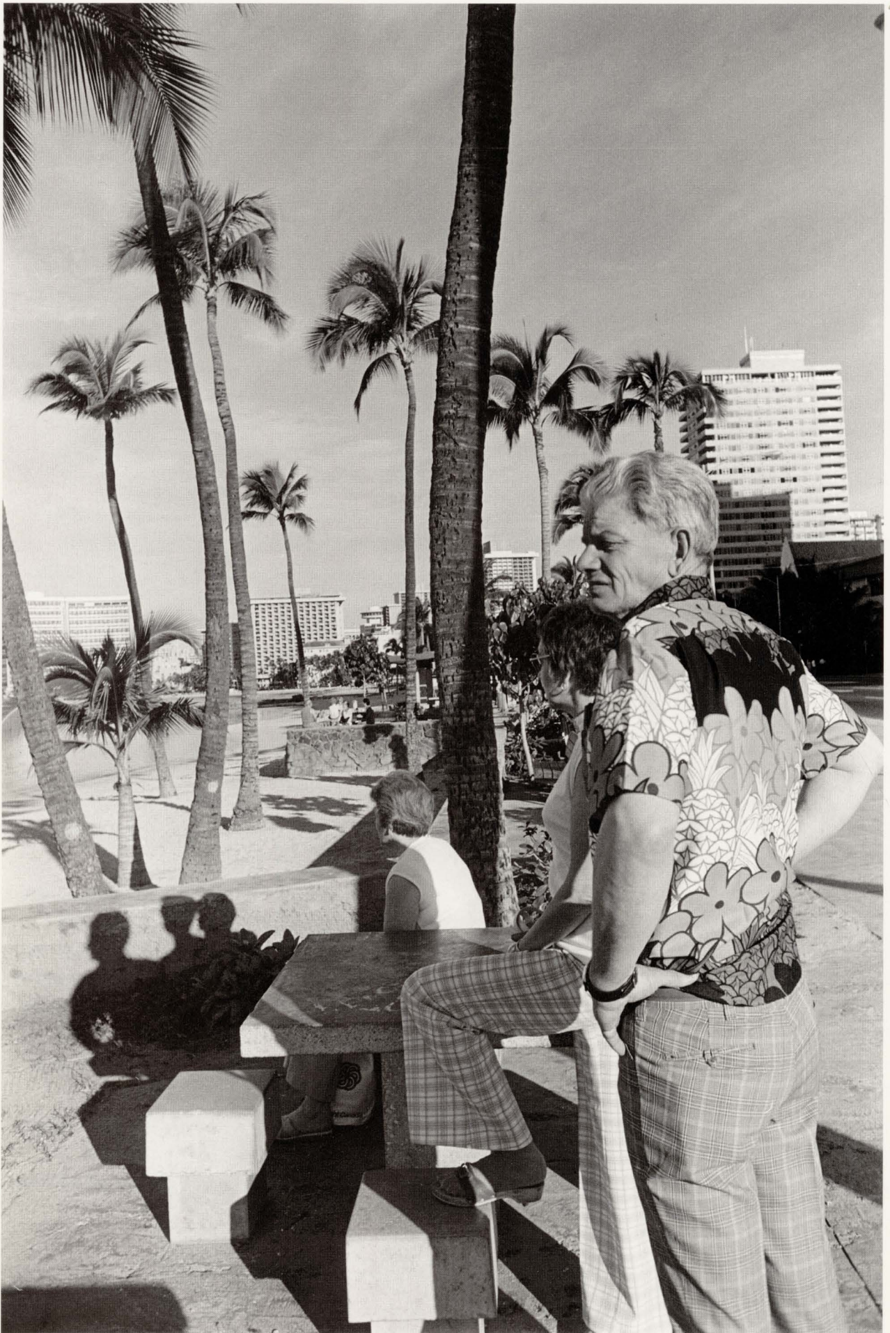
Waikiki, 1975

Courtesy Fraenkel Gallery, San Francisco