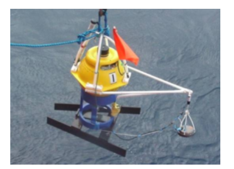
Figure 1: Original Micro-DOBS acquired in 1996 by the Marine Technology Unit.

At present day, the technological development of the new OBS generations at international level is closely linked with the scientific needs and to the