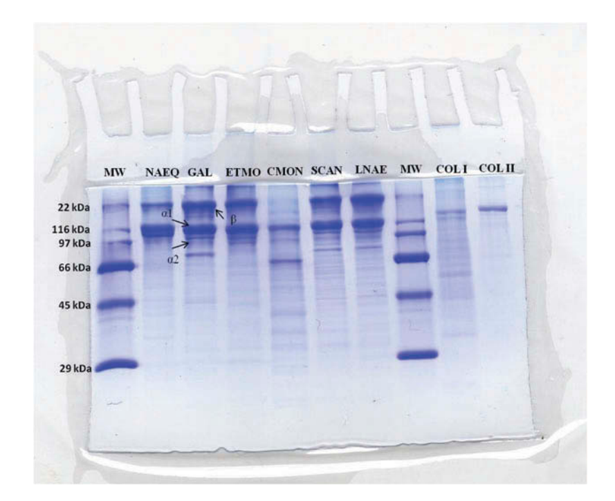
Figure 2. 7% SDS-PAGE showing ASC from different species. M.W: molecular weight standards; Col I: standard collagen type I from mammal; Col II: standard collagen type II from mammal. Keys for species are those shown in Figure 1.