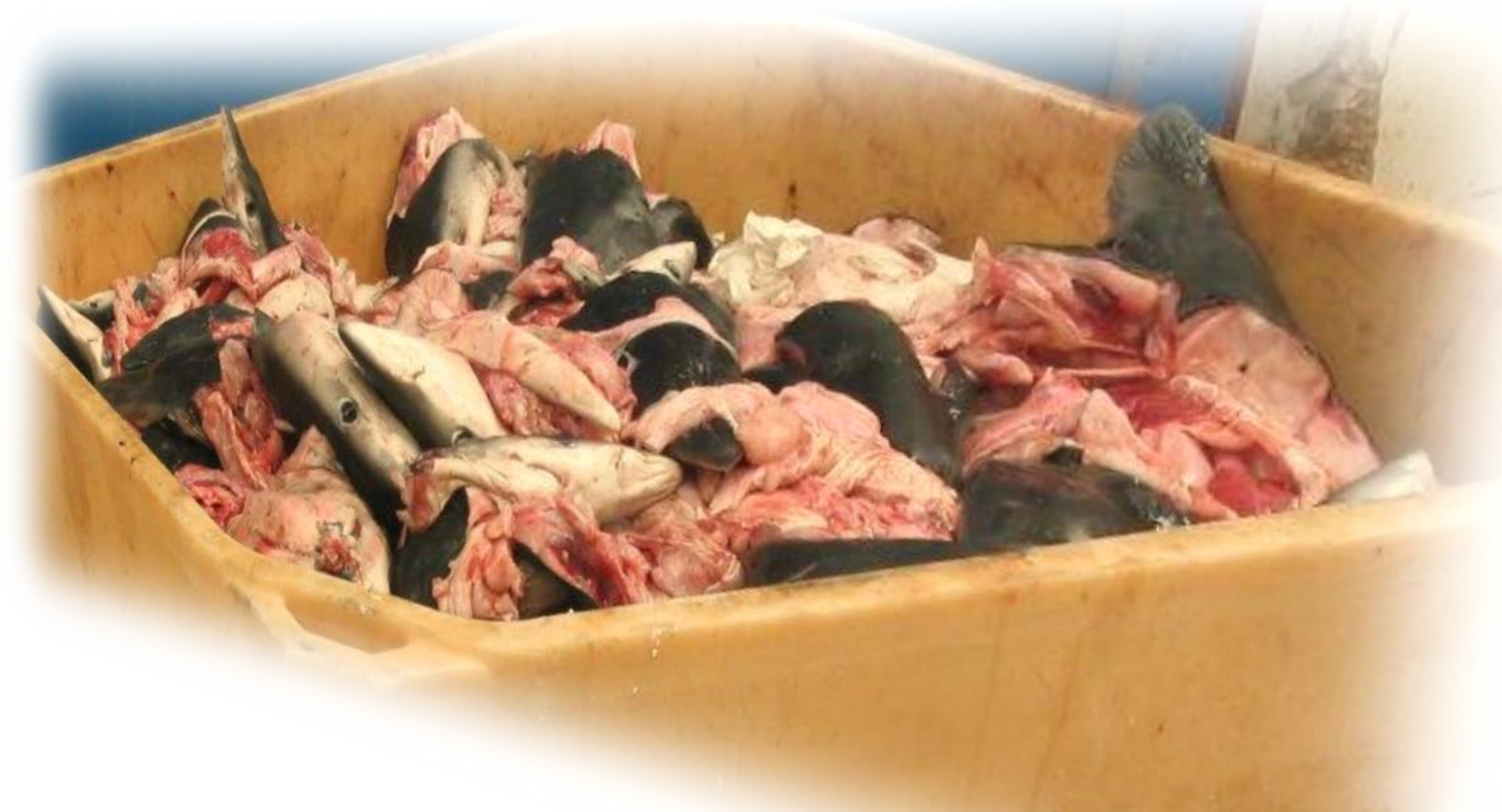
Blue shark by-products