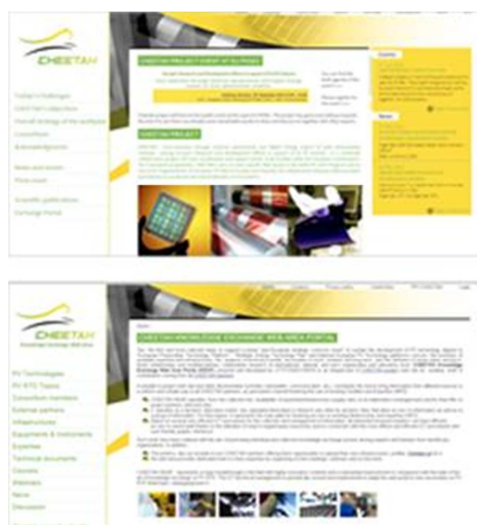
Figure 1: FP7-CHEETAH project web site ( http://www.cheetah-project.eu ) and CHEETAH Knowledge Exchange Area Portal (KEAP) web site ( http://www.cheetah-exchange.eu )

It is also based on the utilization of structured cataloguing criteria applied to PV technologies/PV RTD topics and CHEETAH involved organizations.