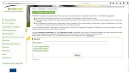
Figure 6. CHEETAH External partners web Log-in area

Access to CHEETAH KEAP is offered by a registration procedure by user name (email) /password. Three different access right levels are arranged depending on the project necessities to access to the information content. The registration procedure offers also the opportunity to collect statistic data (role, gender, nationality, etc) on registered users and the procedure includes also the opportunity to recover forgotten passwords.