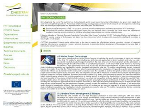
Figure 3 - PV RTD TECHNOLOGIES web page http://www.cheetah-exchange.eu/pv_technologies.asp

The CHEETAH Knowledge Exchange portal uses them as the base to catalogue the offer/demand among consortium partners of requested expertise, infrastructures, equipment, courses, technical documents, by promoting further development of knowledge in the same field of interest also outside of the consortium.