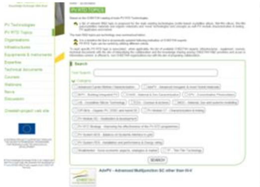
Figure 4: PV RTD TOPICS web page http://www.cheetah-exchange.eu/tags.asp

It is a tentative list that is dynamically updated following the indication of CHEETAH experts. The PV RTD Topic can be sorted by utilizing different criteria. To each specific PV RTD topic is associated, when applicable, the list of available CHEETAH experts, infrastructures, equipment, courses, technical documents with the aim of intensifying the collaboration and the knowledge sharing among CHEETAH R&D providers.