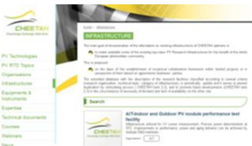
Figure 5 - CHEETAH Infrastructures web pages http://www.cheetah-exchange.eu/infrastructure.asp

The extended database with the description of CHEETAH experts is available to comment/interact on a wide range of PV RTD topics.