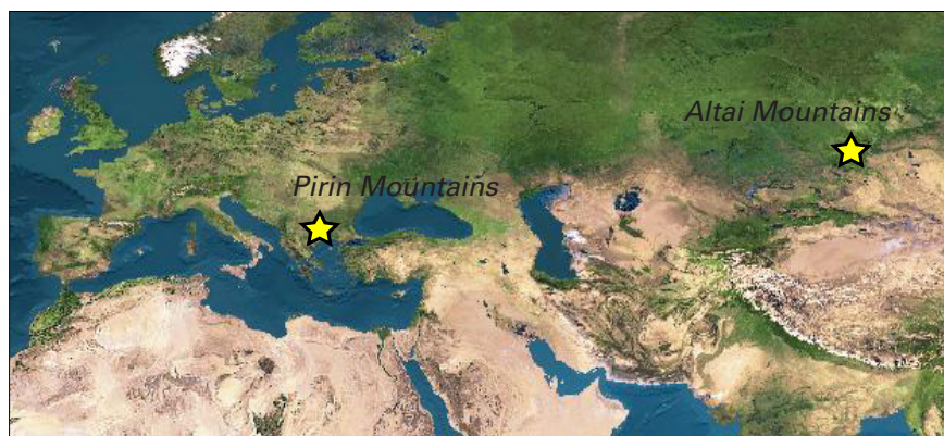
Fig.1: Location of the two case-study areas in the Eurasian mid-continent

Paleoenvironmental reconstructions for the Pirin Mountains (south-western Bulgaria) and the Altai Mountains (southern Siberia, Fig.1) provide insight into the relationships between long-term vegetation dynamics and orbital forcing at two high-elevation sites in the Eurasian mid-continent. The topography of mountain regions constrains vegetation into distinct altitudinal bands, and these bands are sensitive to changes in both temperature and effective moisture through time. The sequence of late-glacial and early-Holocene vegetational change and the vertical displacement of vegetational bands are reconstructed for these mountains by pollen analyses at multiple sites along altitudinal gradients. However, the complexities associated with the dry early-Holocene conditions at these mid-continent sites require additional studies in order to disentangle the various responses of taxa to long-term regional climatic changes.